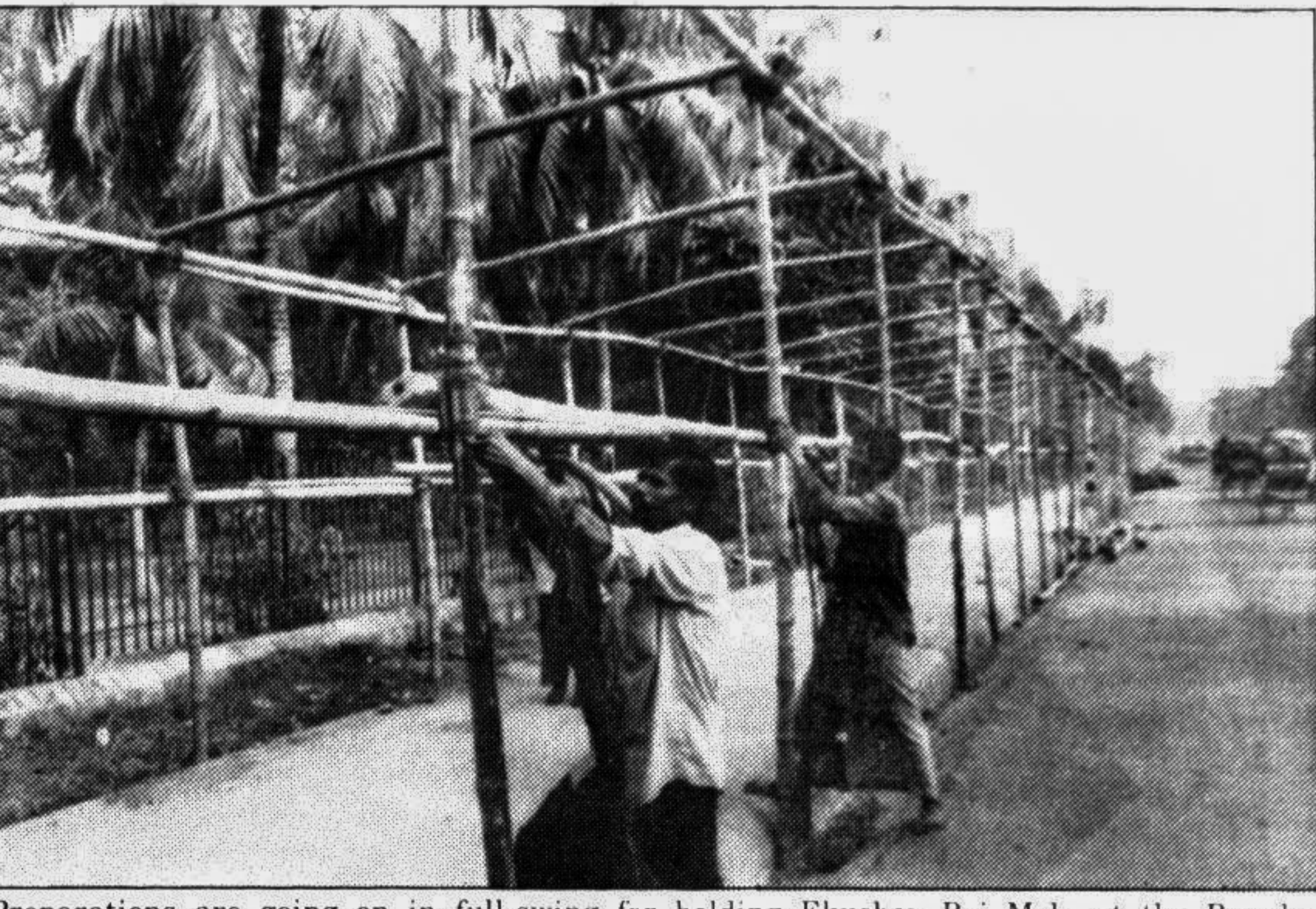
Preparations are going on in full-swing for holding Ekushey Bô Mela at the Bangla Academy premises.

Referring to the messages of the holy Quran, a guideline for the people, the President said, its teachings touch our hearts deeply. In this context, he stressed proper telawat, tarzama and tafsir of the holy Quran with a view to realising its eternal message, saying that there is no room for disregard in this respect.