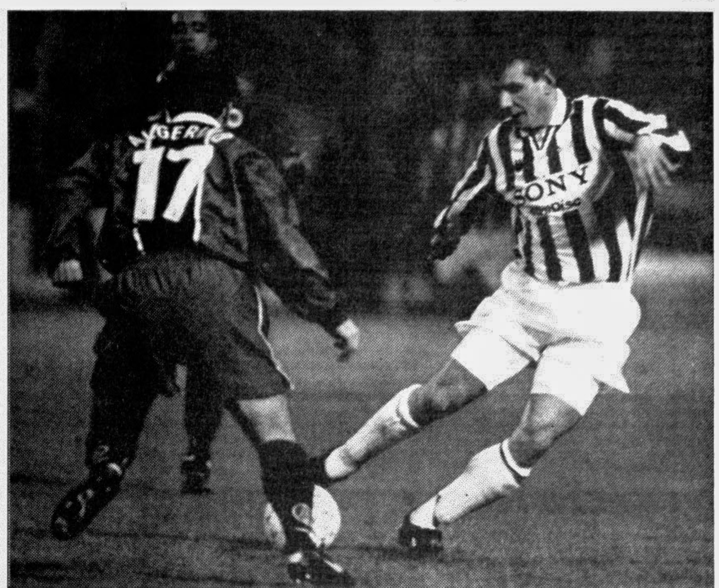
Vladimir Jugovic (R) of Juventus fights for the ball with PSG's Jimmy Algerino during the final of the European Super Cup in Palermo, Italy on Feb 5.

Chiesa signed from Sampdoria for 10 million pounds (15 million dollars) in the summer, has earned his recall after he spearheaded Parma's mid-season revival from relegation candidates to championship contenders.