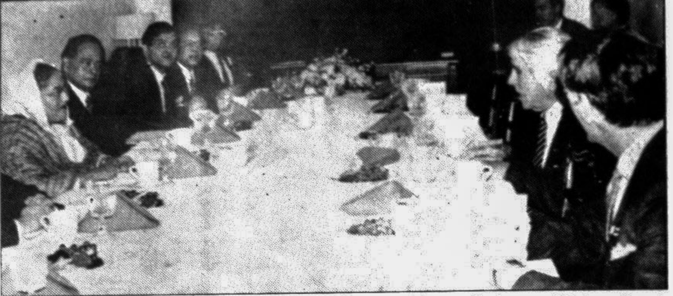
Prime Minister Sheikh Hasina talking with Benjamin Gilman, Chairman of International Relations Committee of the US Congress, at Capitol Hill in Washington Tuesday.