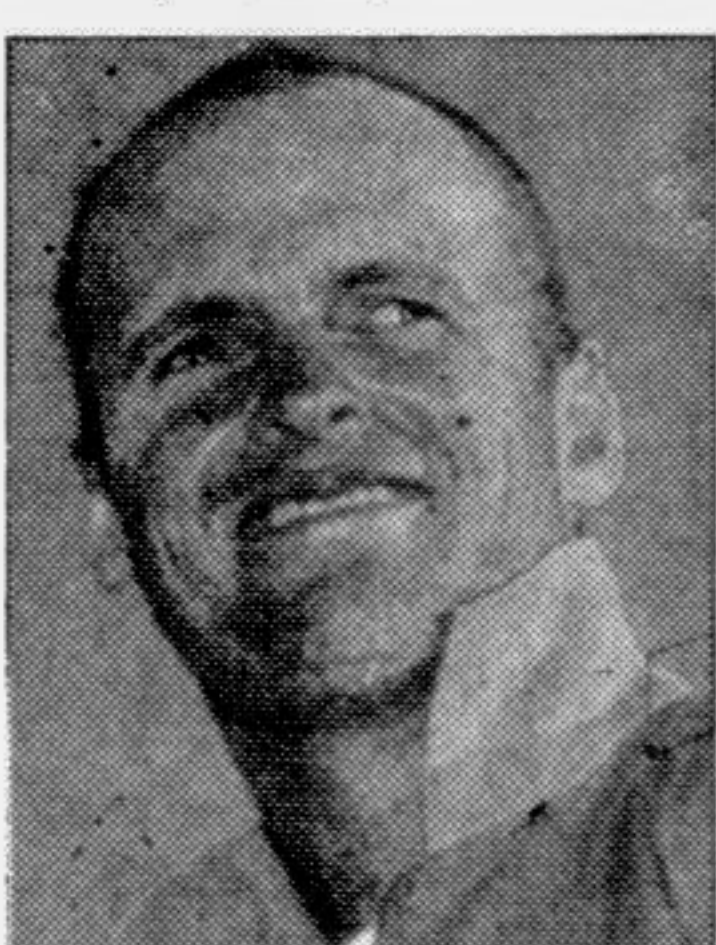
KIRSTEN ... m-o-m

Did not bat: S Pollock, D Richardson, L Klusener, A Donald, P Adams.