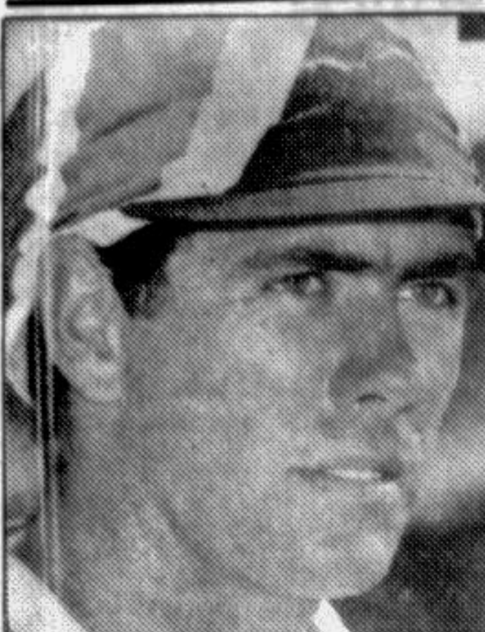
Hansie Cronje (South Africa Captain)

"The conditions would be far different in South Africa. You won't get surfaces which become loose in the first session of a Test. You will get good Test match pitches. There will be bounce and seam movement for the bowlers. No international team would like to play a Test match on a pitch like this one (at Motera)."