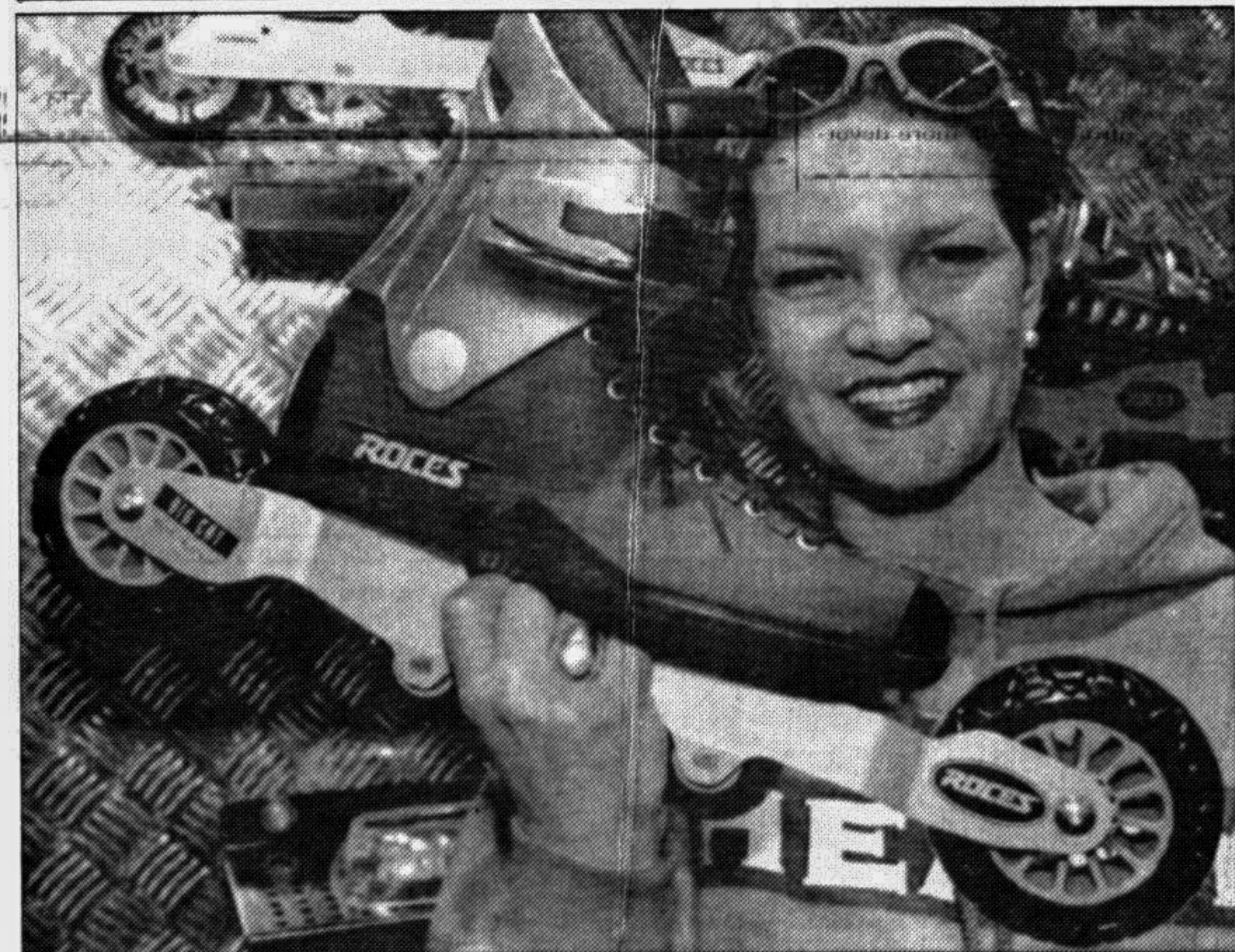
An unidentified employee of the Sporting Goods and Fashion Fair poses with a new 'Big Cat' off-road inline skate in Munich on Feb 3.