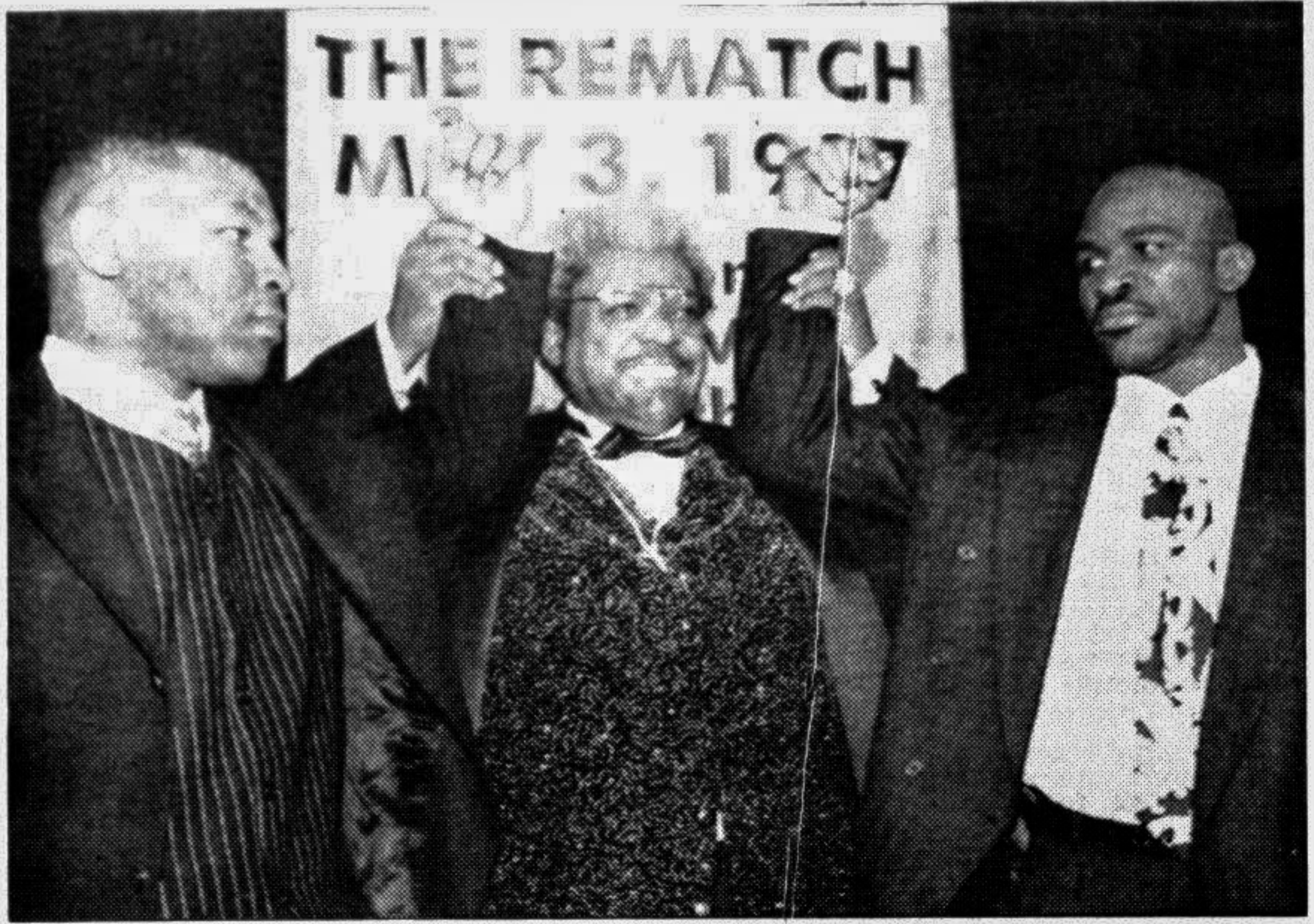
Boxing promoter Don King (C) holds up Evander Holyfield (R) and Mike Tyson's hands after a press conference in New York on Feb 3.