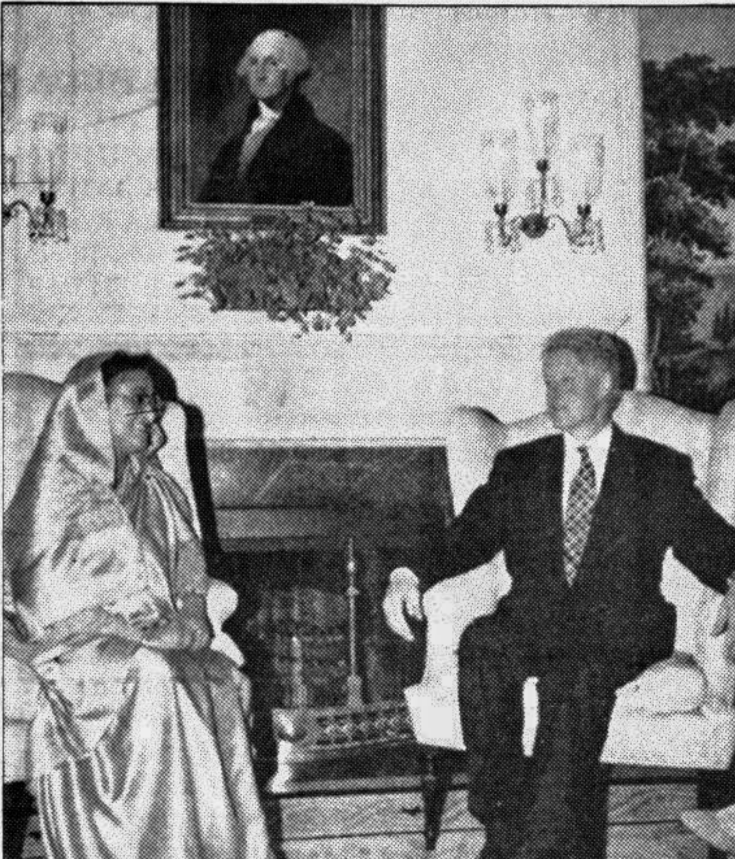
Prime Minister Sheikh Hasina met US President Bill Clinton at the White House Monday.

WASHINGTON, Jan 4: Prime Minister Sheikh Hasina had 20 minutes of exclusive talks with US President Bill Clinton at the Oval Office of White House on Monday, reports UNB.