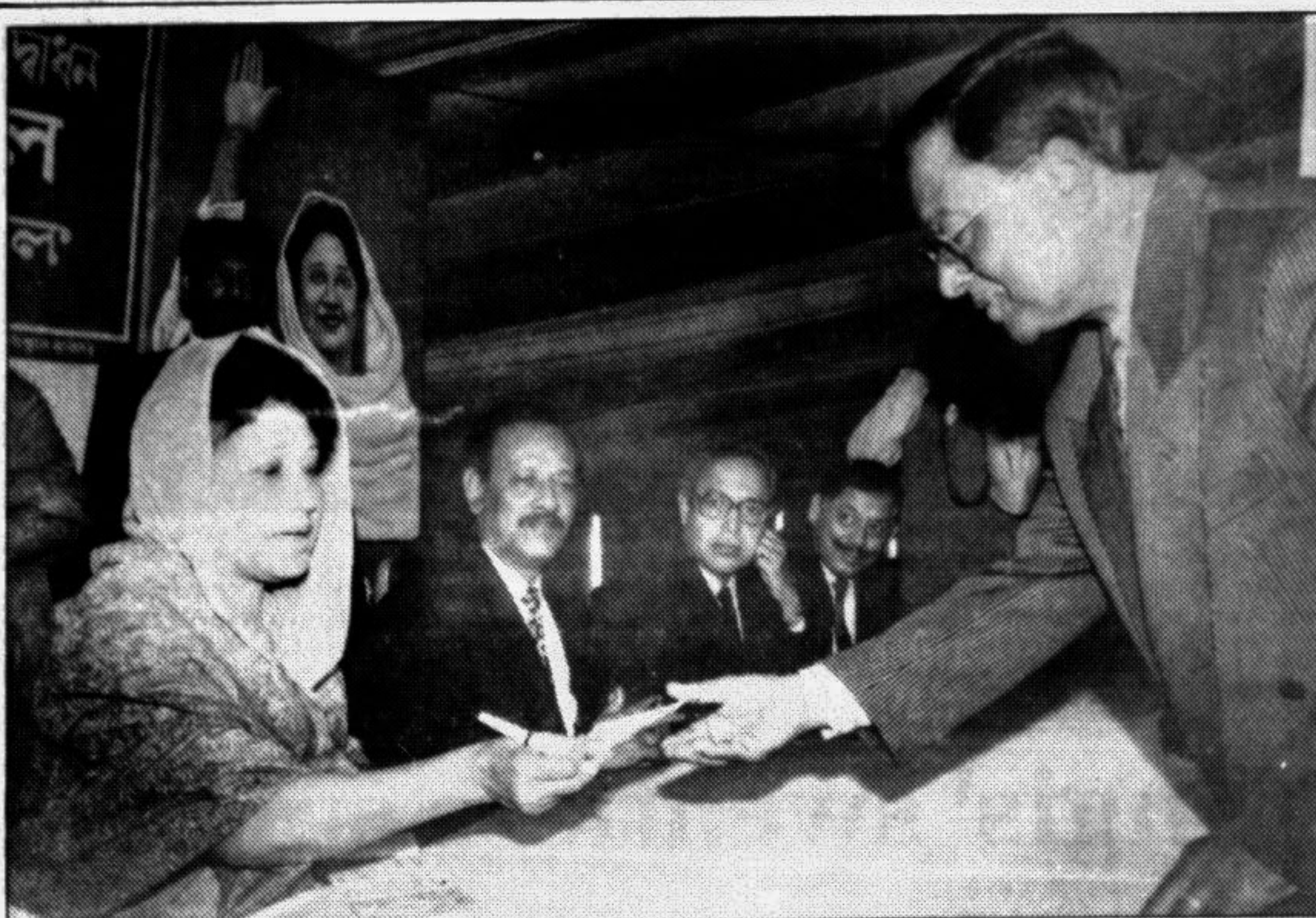
BNP chairperson and Leader of the Opposition in the Jatiya Sangsad Begum Khaleda Zia giving receipt to a member of the party on the first day of the party's membership renewal and collection drive at her Minto Road official residence yesterday.