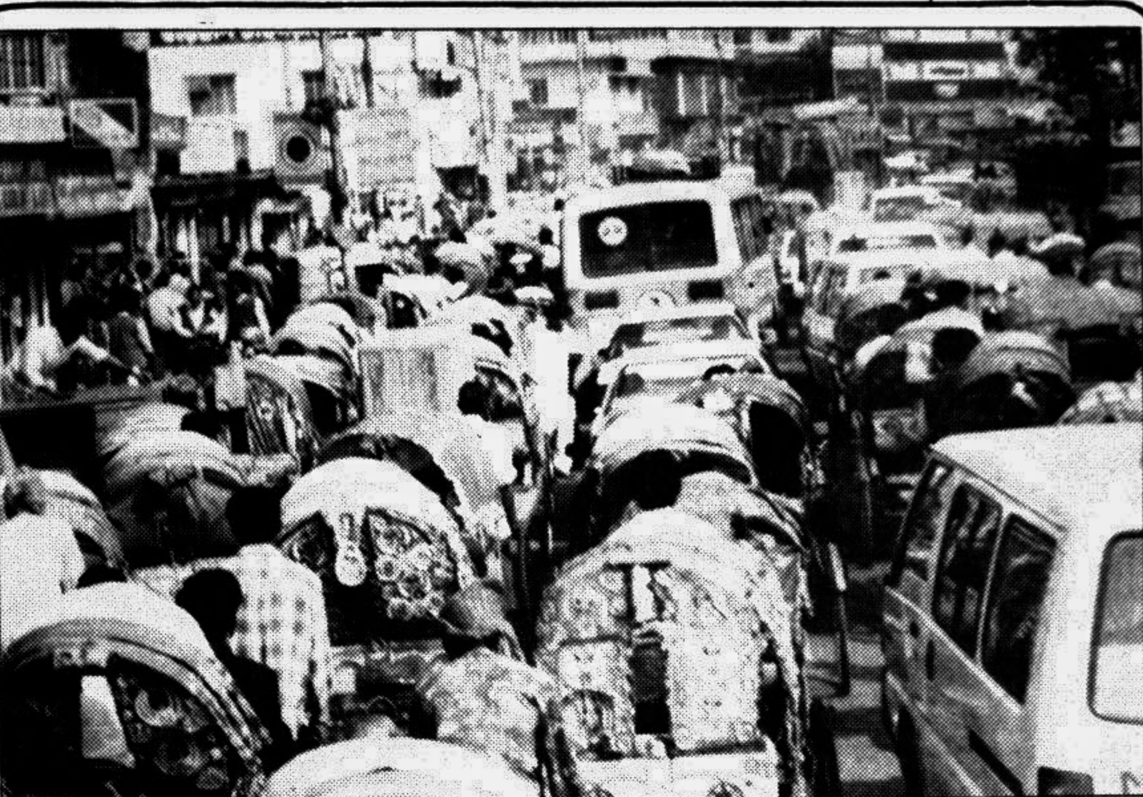
The city's traffic situation has become almost unmanageable as Eid shopping is gaining momentum.