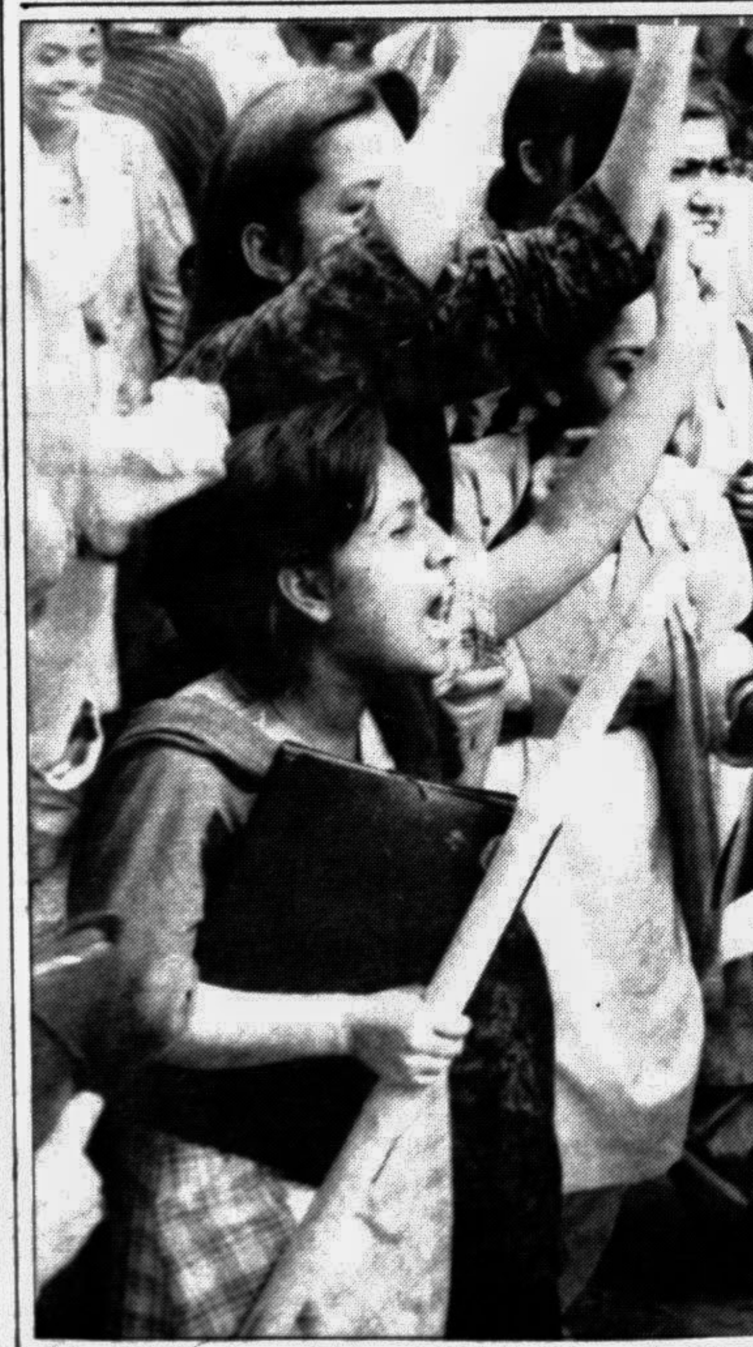
Some HSC students of Lalmatia Mohila College who failed in HSC test examinations brought out a procession inside the college yesterday.