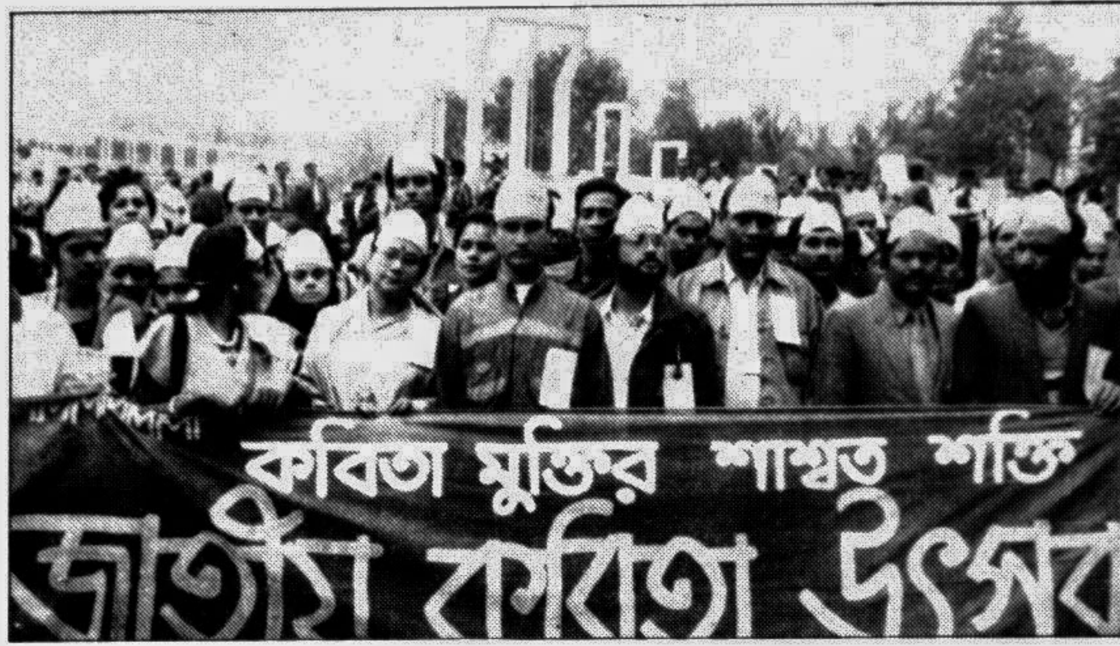
Jatiya Kabita Parishad brought out a colourful procession in the city yesterday marking the opening of the two-day national poetry festival.

For more information call - Head Office: 9665114-7, Fax: 9665112