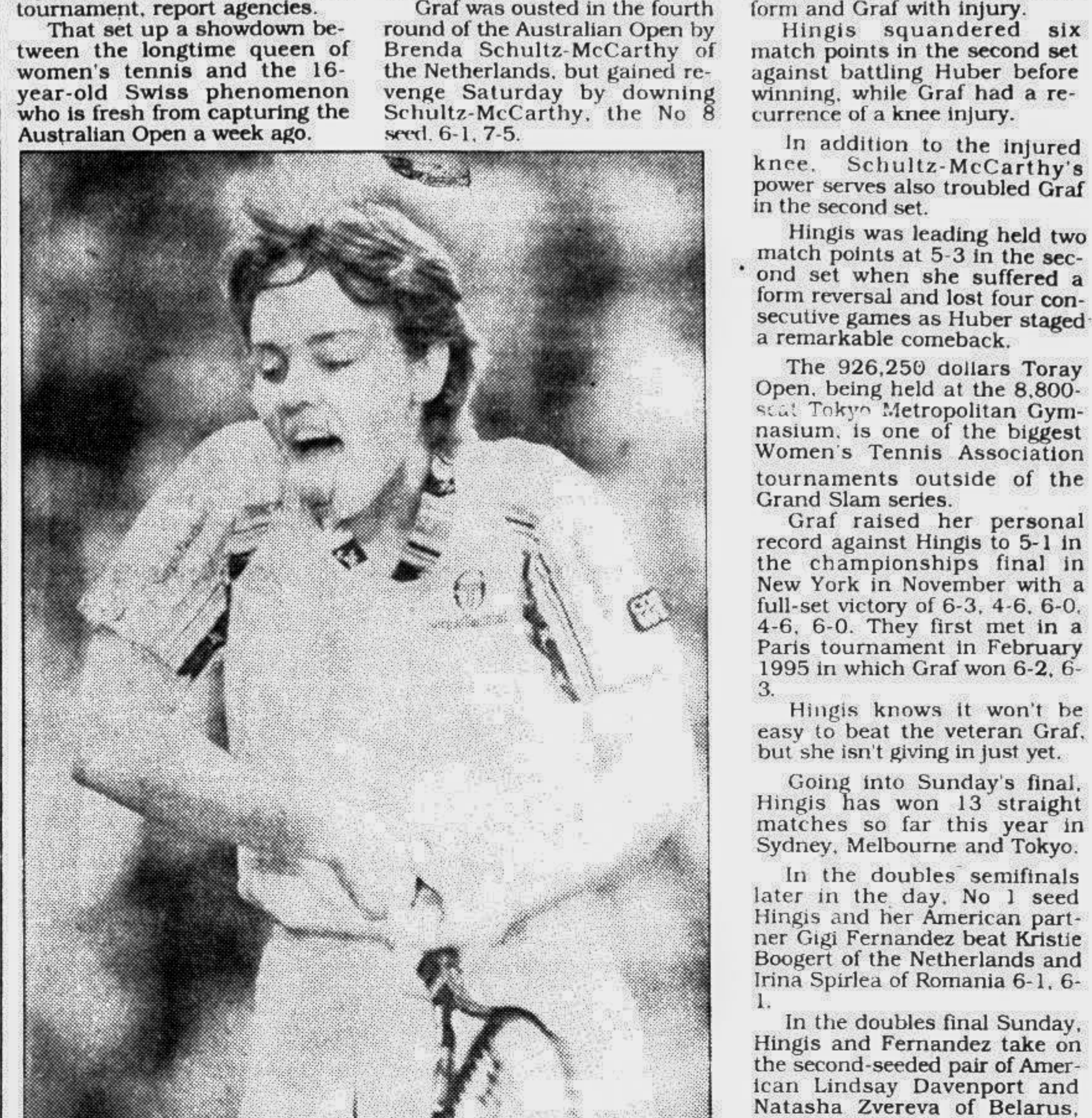
World number two Swiss Martina Hingis breathes a sigh of relief after winning a hard-fought point against Anke Huber of Germany in their semifinal clash of the Toray Pan Pacific Open in Tokyo yesterday. Hingis entered the final with a 6-1, 5-7, 6-2 win.

The doubles event offers a first prize of 45,000 dollars compared with 150,000 dollars for the singles.