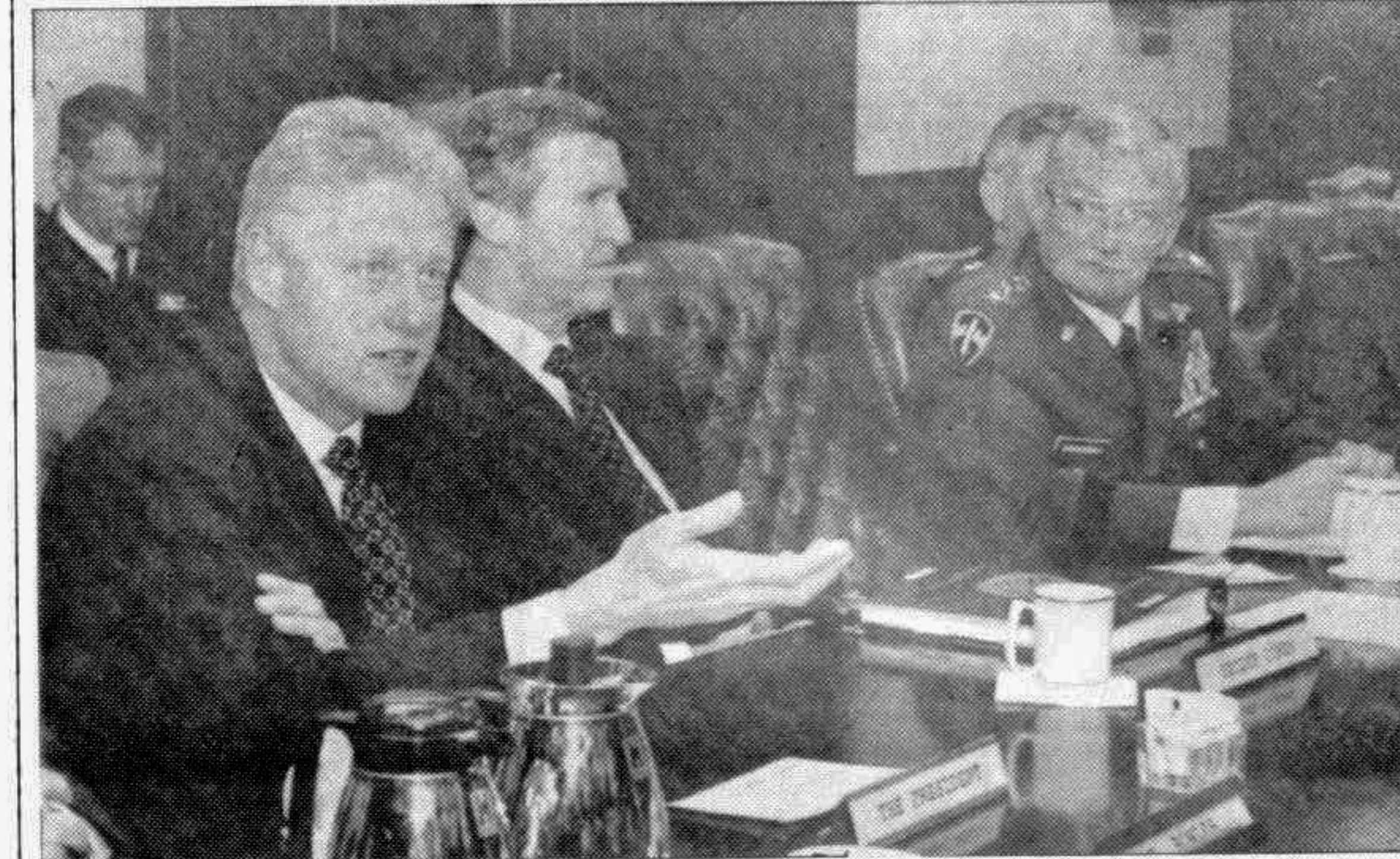
US President Bill Clinton (L) makes a point during a press conference as US Secretary of Defense William Cohen (C) and Joint Chiefs of Staff Chairman General John Shalikashvili (R) watch at the Pentagon in Washington, DC Wednesday. Clinton told reporters he would not expand the mission of NATO-led forces in Bosnia to track down and arrest warcrimes suspects.

RIO DE JANEIRO, Brazil: A tiny acrobat inhabits the forest canopy of Brazil's vast cocoa plantations, and its discovery has left bird lovers elated — and alarmed, reports AP.