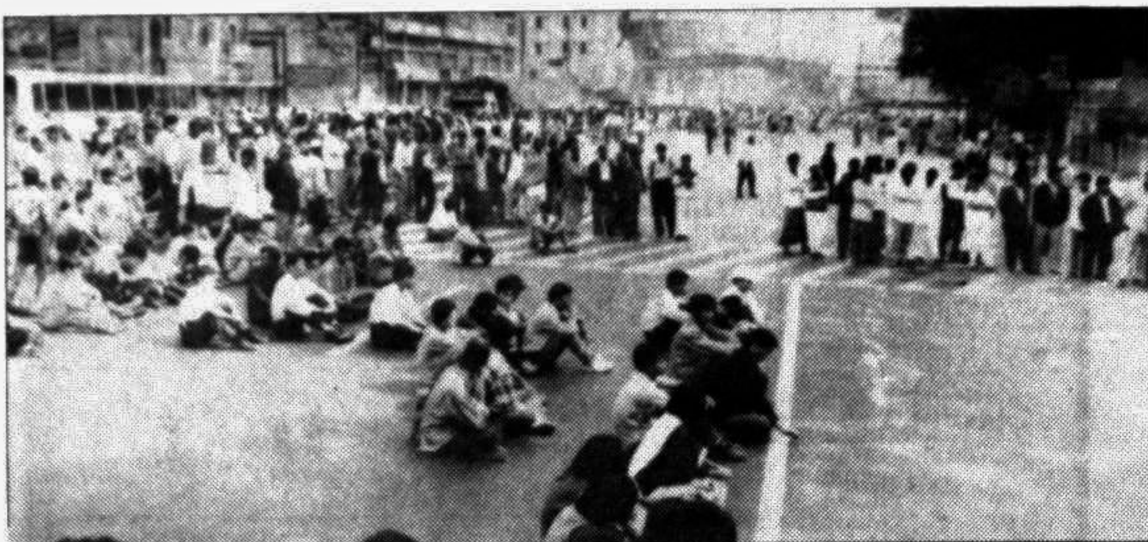
A Hill students' organisation held a sit-in rally in front of the Jatiya Press Club yesterday.

House No 79, Road No 23, Gulshan-1 (Near the Gastro Liver Clinic), Tel: 883845, 605766, 606773. S-90