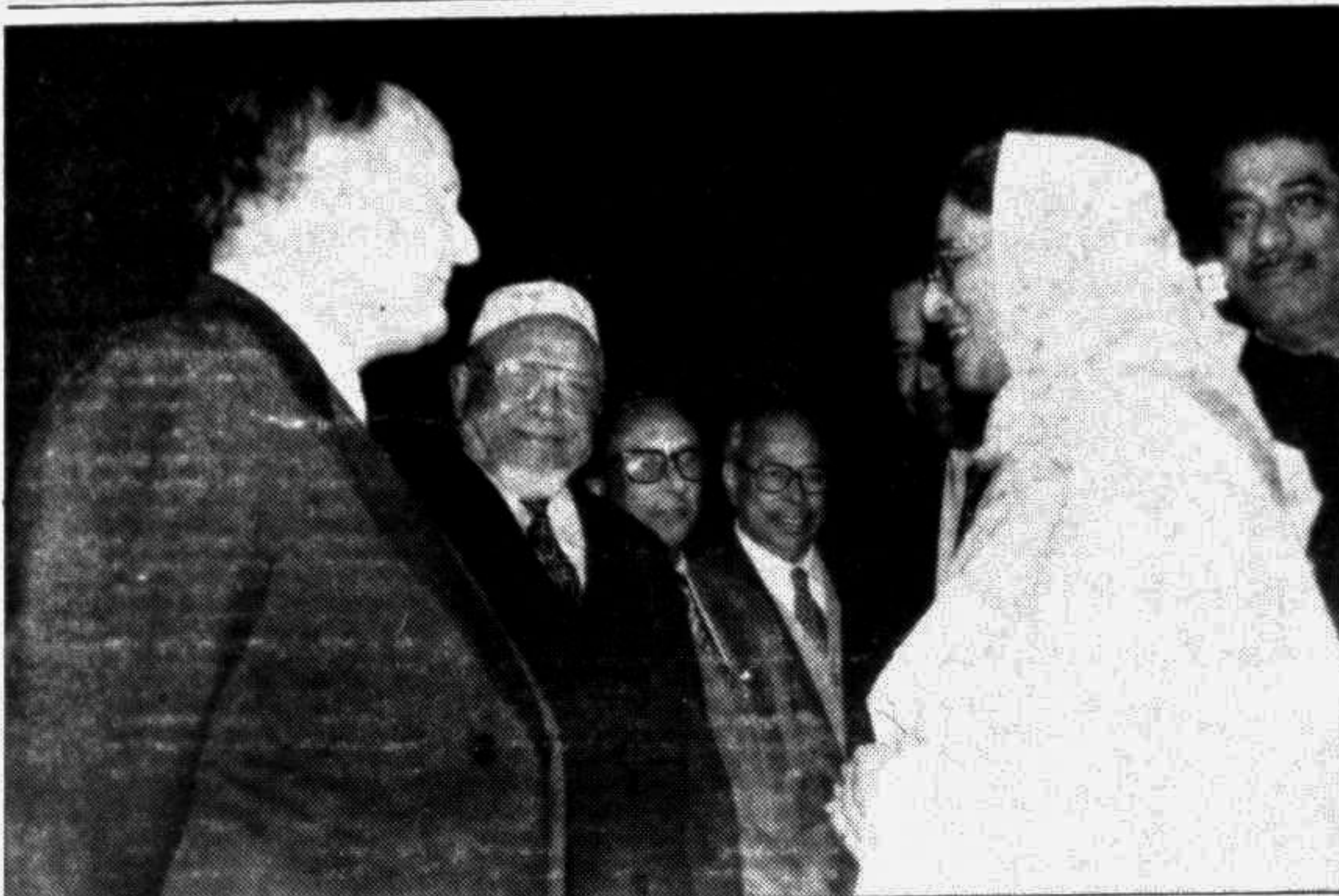
Prime Minister Sheikh Hasina talking to US Ambassador David N Merrill at the Zia International Airport prior to her departure for Washington yesterday to attend the Micro Credit Summit there.