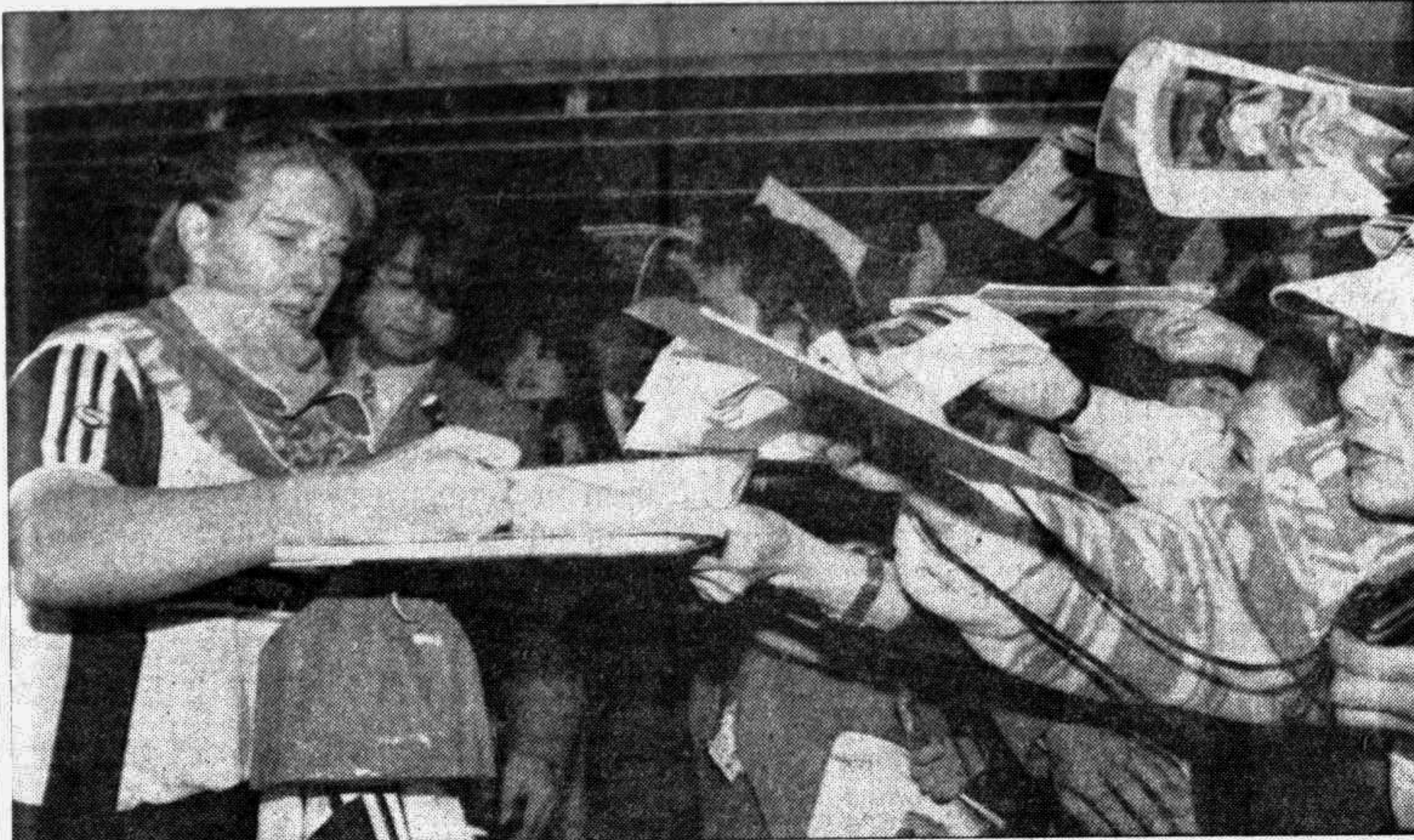
World number one Steffi Graf of Germany signs autographs for her Japanese fans after a second round match against American Lisa Raymond at the Toray Pan Pacific Open in Tokyo yesterday. Graf won 6-3, 6-2.