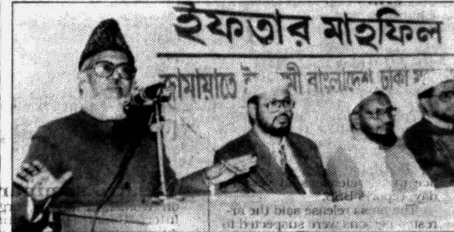
Mawlana Matiar Rahman Nizami, secretary general of the Jamaat-e-Islami, Bangladesh, speaking at an iftar party hosted by Jamaat for journalists at the auditorium of the Photo — Journalists Association in the city yesterday.