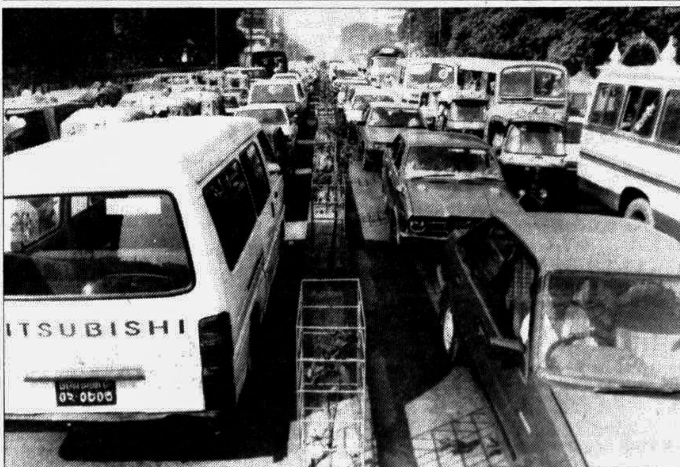
A long traffic jam from Shahbagh Avenue to Farmgate area led to a total collapse in the city's traffic system yesterday. This photograph was taken in front of Dhaka Sheraton Hotel.