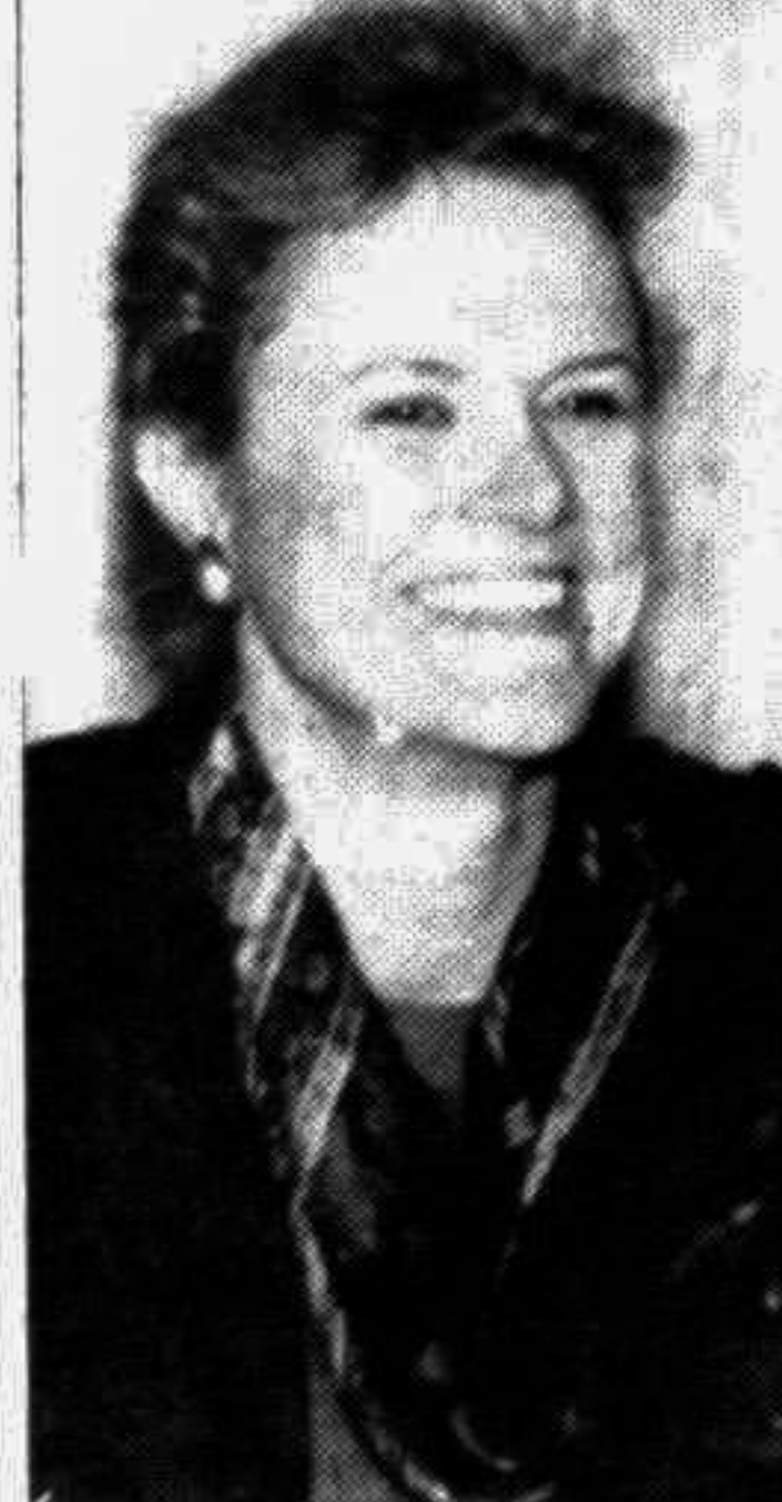
Robin Raphael addressing a press conference yesterday.

The United States supports the idea of greater co-operation among regional countries for economic development and it was not opposed to the concept of sub-regional co-operation if it enabled taking up 'sensible projects'.