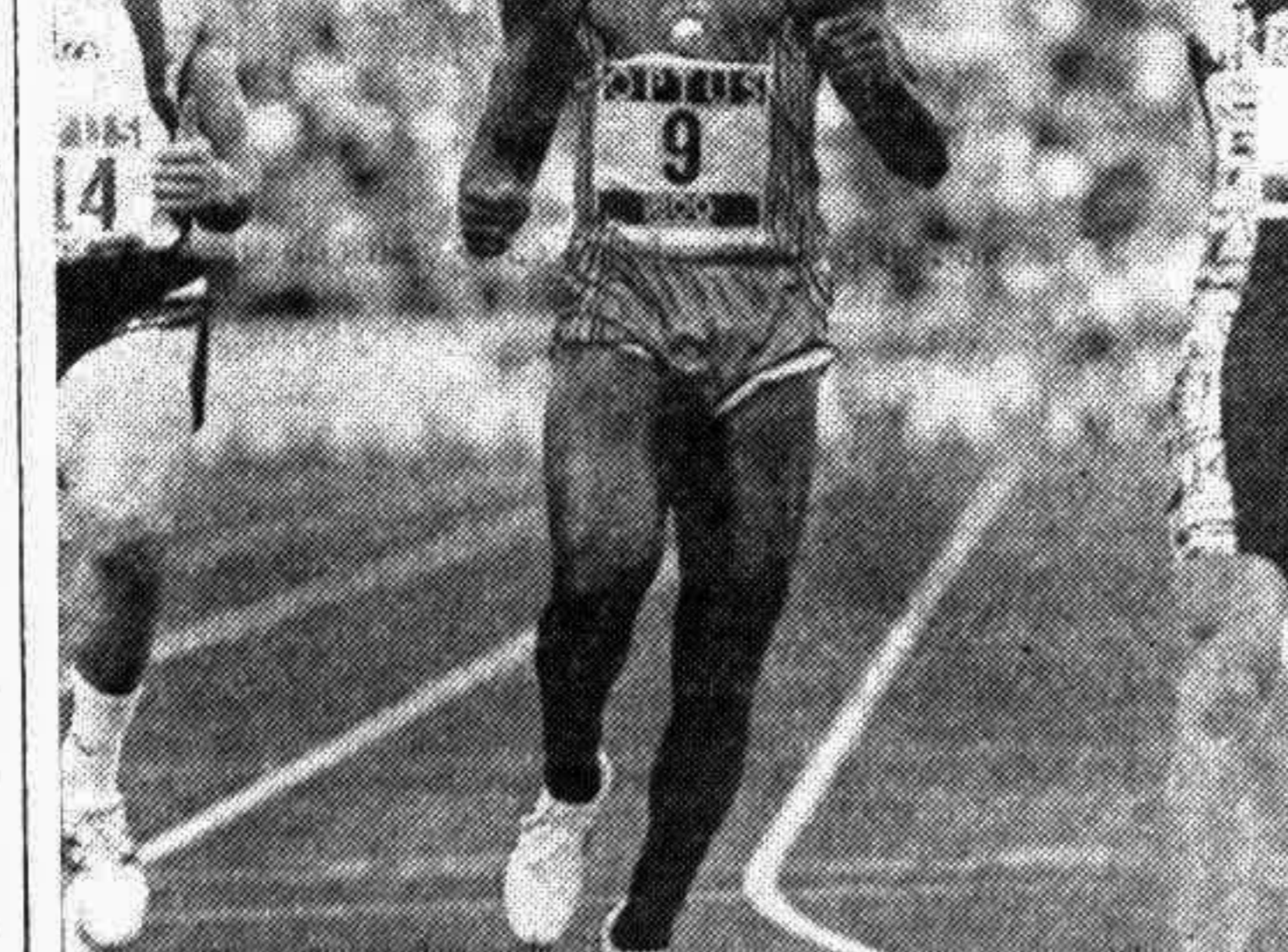
Olympic legend Carl Lewis (C) of the United States finishes equal seventh in a 100 metres sprint at the site of the 2000 Summer Games in Sydney yesterday.

Chelsea, down 2-0 on goals by Robbie Fowler and Stan Collymore, scored four times in 25 minutes in the second half. Mark Hughes, coming off the bench at half time, scored in the 50th, with another by Italian Gianfranco Zola in the 57th and the clincher in the 62nd by fellow Italian Gianluca Vialli. Vialli, benched for the past few games, got another in the 75th on a header.