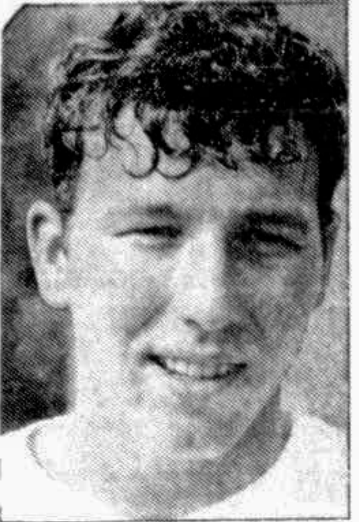
Mike Atherton (England cricket captain) 'They're a bit of a fix for US. On England losing to Zimbabwe recently.

Sports WHIZZ KID COMPETITION FOR SCHOOL CHILDREN