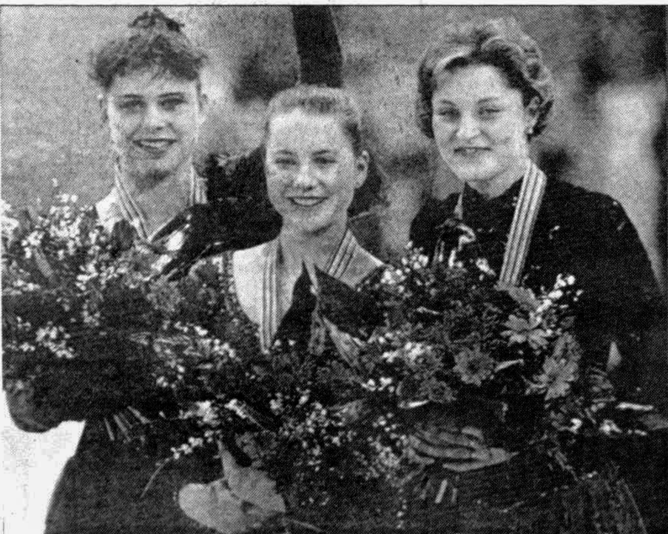
Gold medalist Irina Slutskaya of Russia is flanked by Krisztina Czako (L) of Hungary and Yulia Lavrenchuk of Ukraine on the podium after the European figure skating championships in Paris on Jan 25.

Upashahar Housing Estate after put into bat were all out for 114 in 29.2 overs. In reply, Golden Sunshine reached 118 for five in 30 overs.