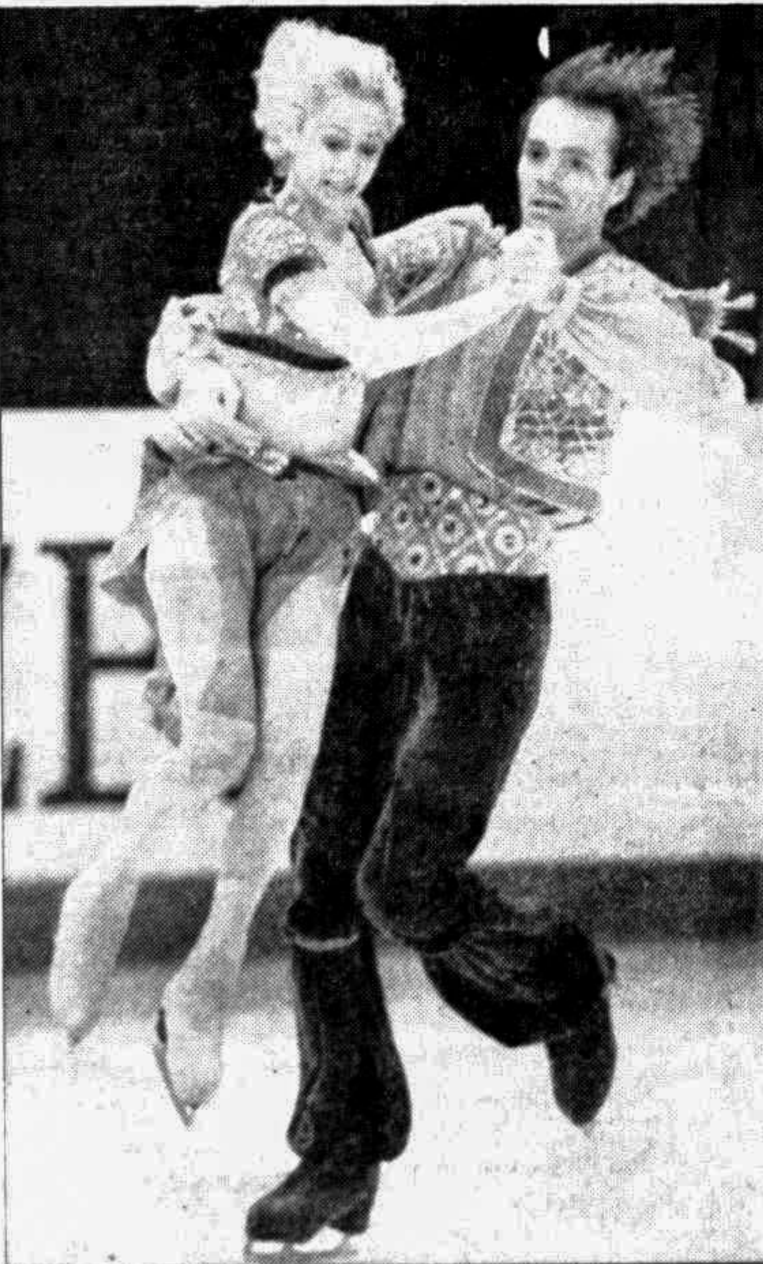
Russian world and Olympic champions Oksana Grishuk and Yevgeny Platov perform at the European figure skating championships in Paris on Jan 24. The pair won the title.