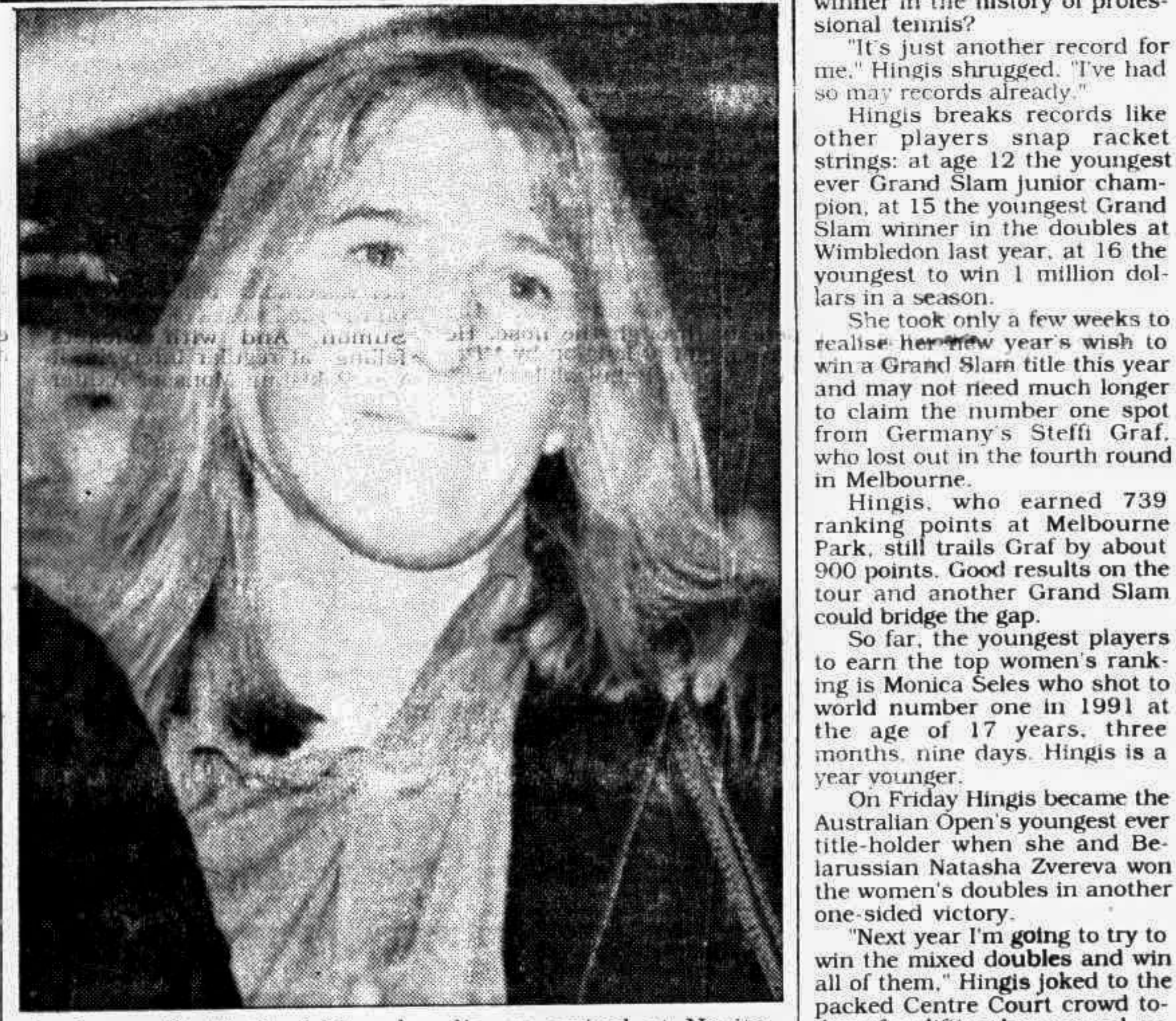
A gloomy Steffi Graf bites her lip on arrival at Narita International Airport in Tokyo yesterday. The German tennis queen will take part in the Toray Pan Pacific tournament.

"I have a pretty big chance," she added. "I just want to play very good tennis at the next tournament and see what happens in Paris (at the French Open) and the other Grand Slams."