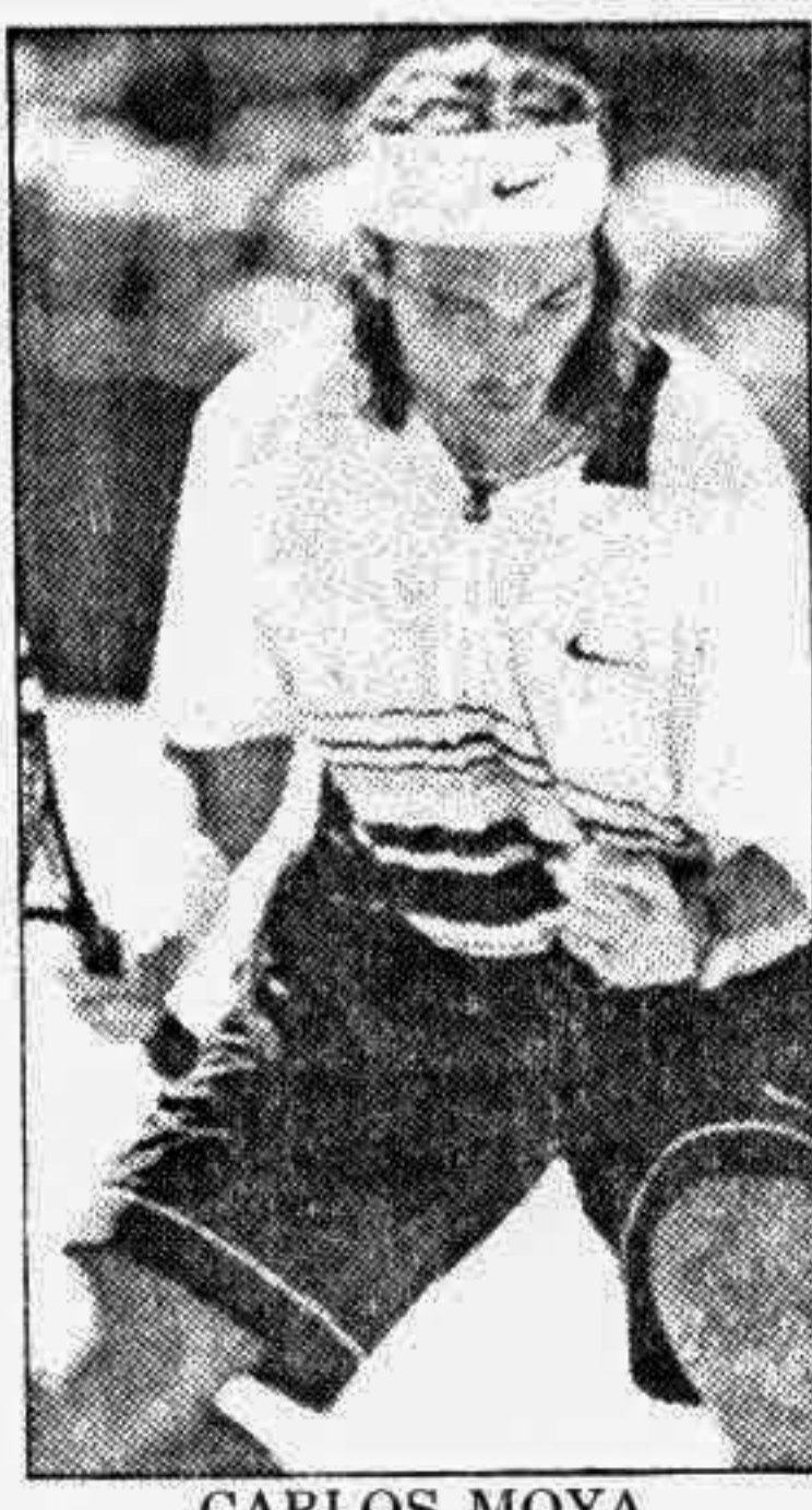
Moya is the first Grand Slam final against world number one who won here in 1994 and lost in the final the next year. It will be the 11th Grand Slam final