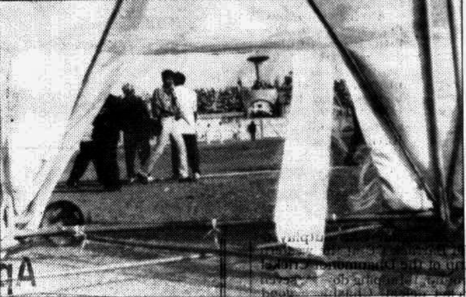
A VIEW THRU' THE SIGHTSCREEN: The torn sight screen in yesterday's Mohammedan-Brothers Premier Division cricket league tie stands as the mute witness to the vandals who throng the sports grounds in the garb of fans.