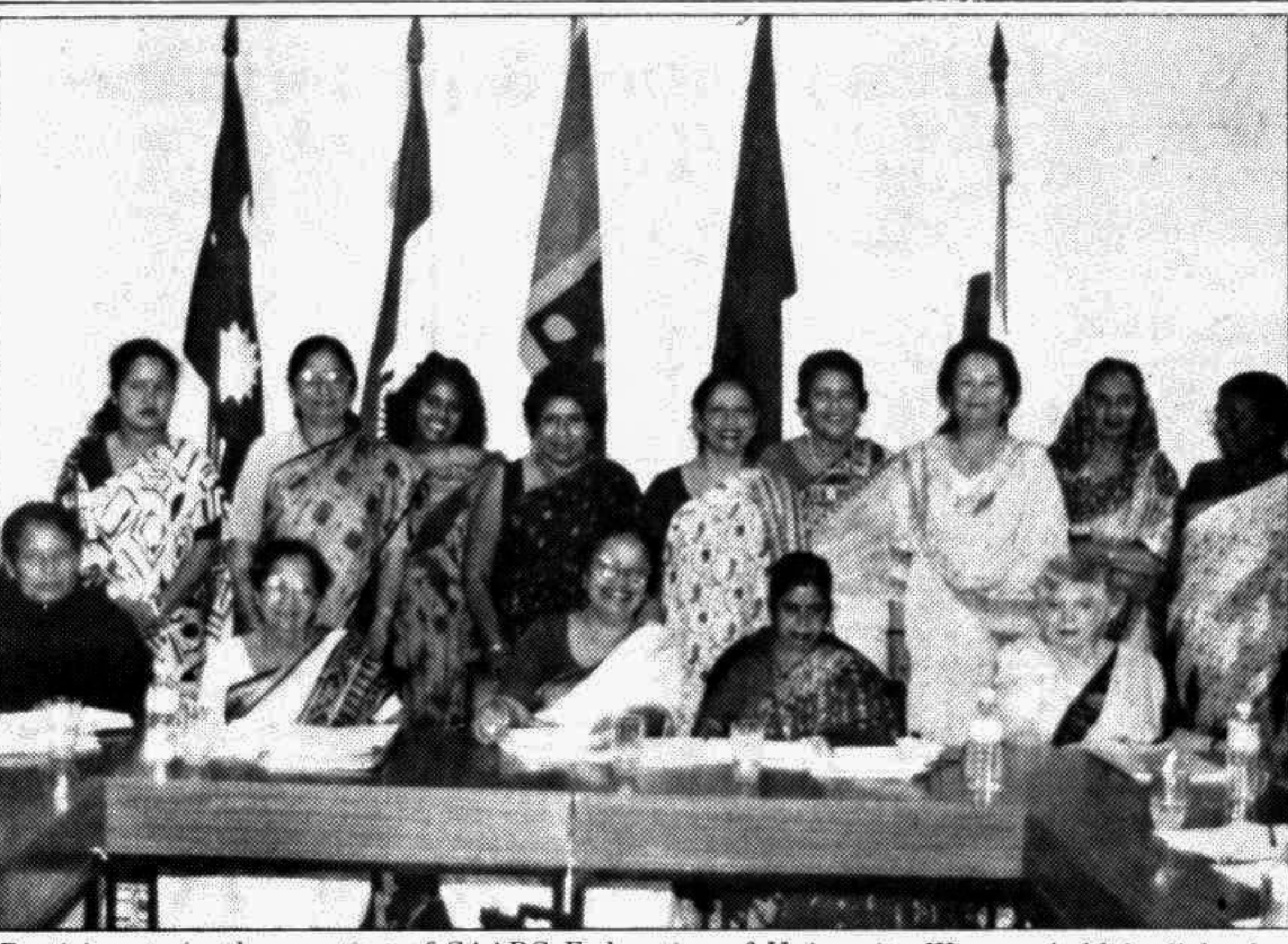
Participants in the meeting of SAARC Federation of University Women, held in Colombo recently.

Another report adds: The United States expressed concern Tuesday over fighting in southern and eastern Sudan and called for talks between the government and rebels "and anyone else involved in this fighting."