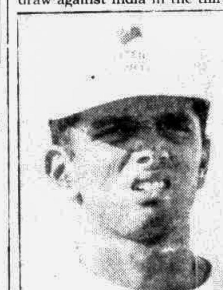
DRAVID .... man-of-match cricket Test, report agencies.

JOHANNESBURG, Jan 20: Daryll Cullinan made up for a horrendous running error by stubbornly scoring an unbeaten 122 Monday to help South Africa salvage a draw against India in the third