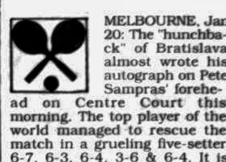
MELBOURNE, Jan 20: The "hunchback" of Bratislava almost wrote his autograph on Pete Sampras' forehead.

ad on Centre Court this morning. The top player of the world managed to rescue the match in a grueling five-setter 6-7, 6-3, 6-4, 3-6 & 6-4. It is