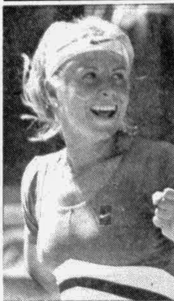
Amanda Coetzer (South African tennis star) It's always great to beat somebody like that for the first time. But to do it twice really makes me feel good, it gives me a lot of confidence.

After beating Staffi Graf in Australian Open.