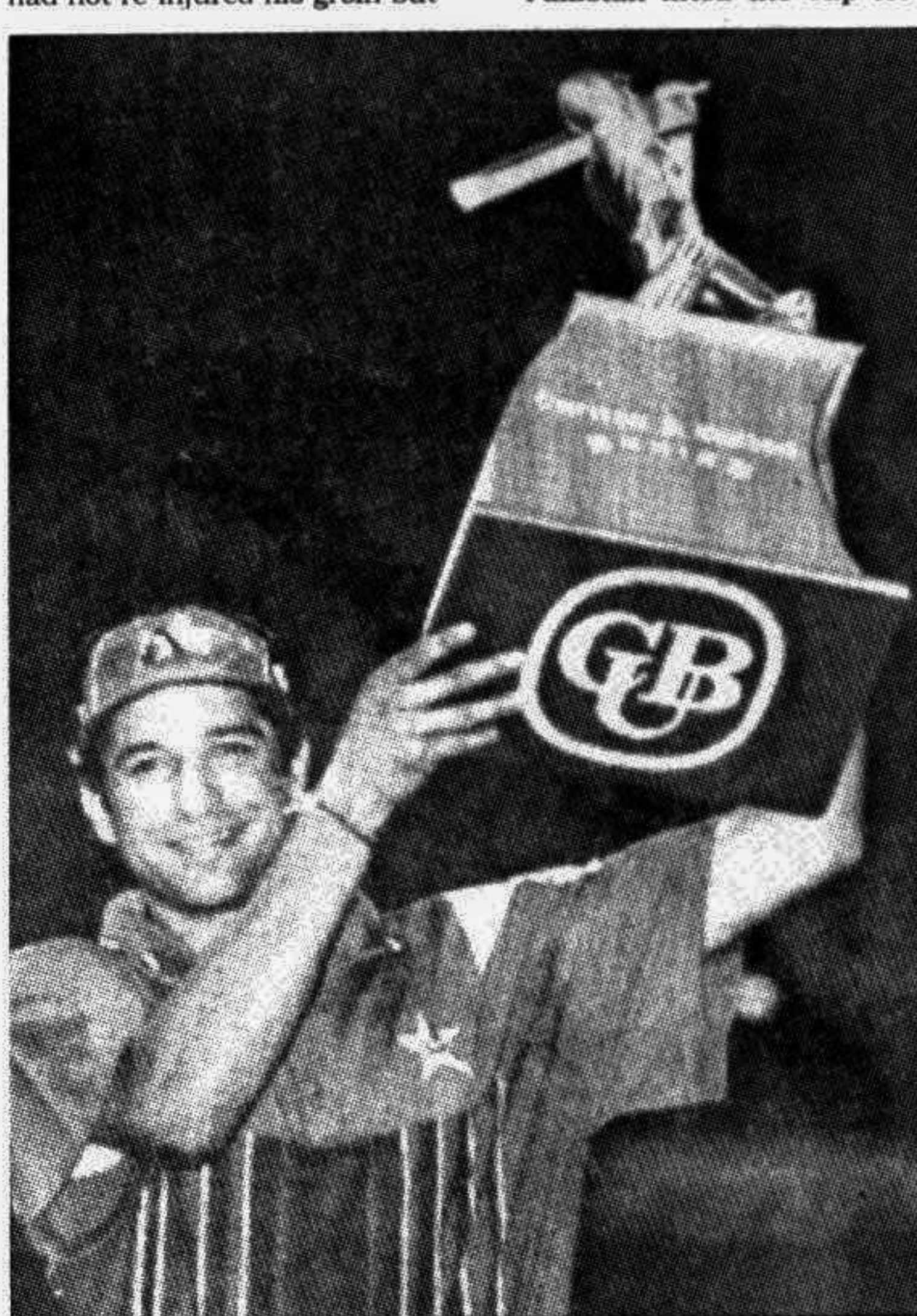
Pakistan captain Wasim Akram holds aloft the World Series trophy after his side won the best-of-three finals 2-0 against the West Indies in Melbourne yesterday.

wicket between Ijaz and Mohammad Wasim. Ijaz Ahmed, top-scorer in Pakistan's four-wicket victory in the opening game in Sydney on Saturday, scored 45 to bolster the middle-order, while Mohammed Wasim hit 41 in the final overs off 79 balls. Pakistan lifted the cup for