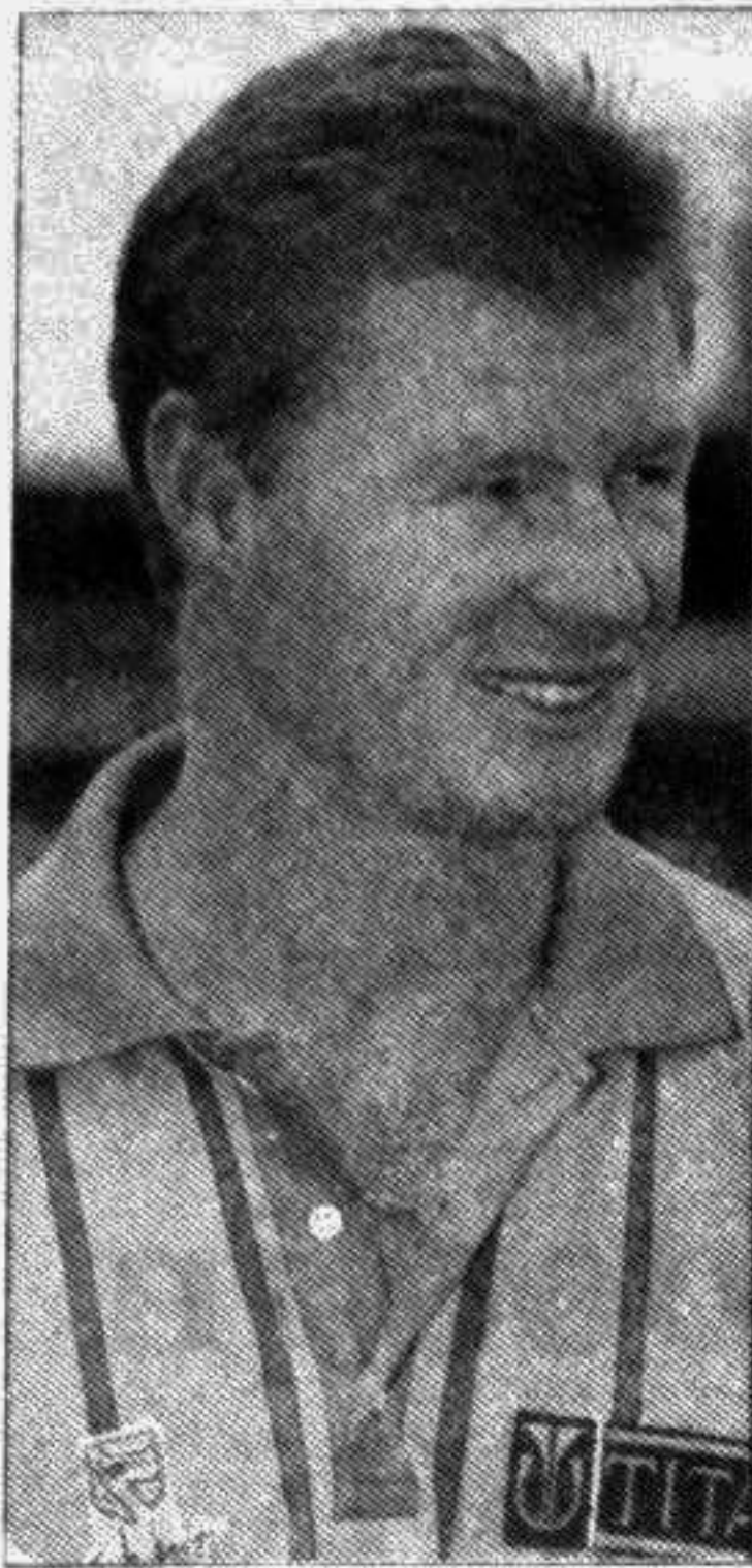
Lance Klusener (South African speedster) "I have battled pretty nicely in recent times. But I have not been quite consistent with the bat. So at the moment I am a bit of a bowler who can bat." (On whether he considers himself as an all-rounder)

✓ Tick the Correct Answers Competition closes : 8 pm Jan 31, '97