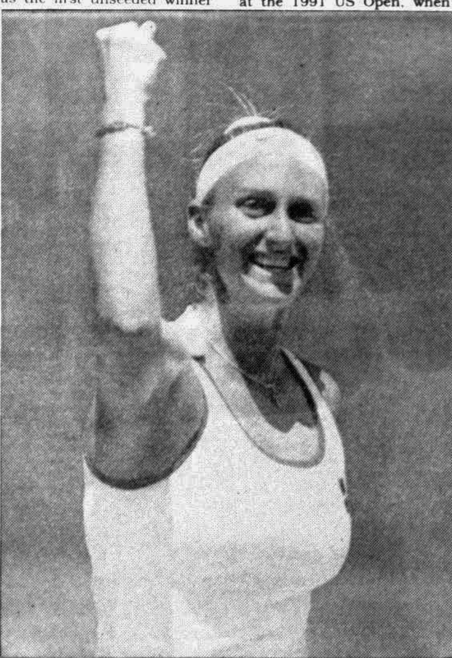
Mary Pierce of France jubilates after defeating fifth seed Anke Huber of Germany in the round of sixteen at the Australian Open yesterday. Pierce won 6-2, 6-3.

"Let's hope so," said Pierce, last unseeded at a Grand Slam at the 1991 US Open, when