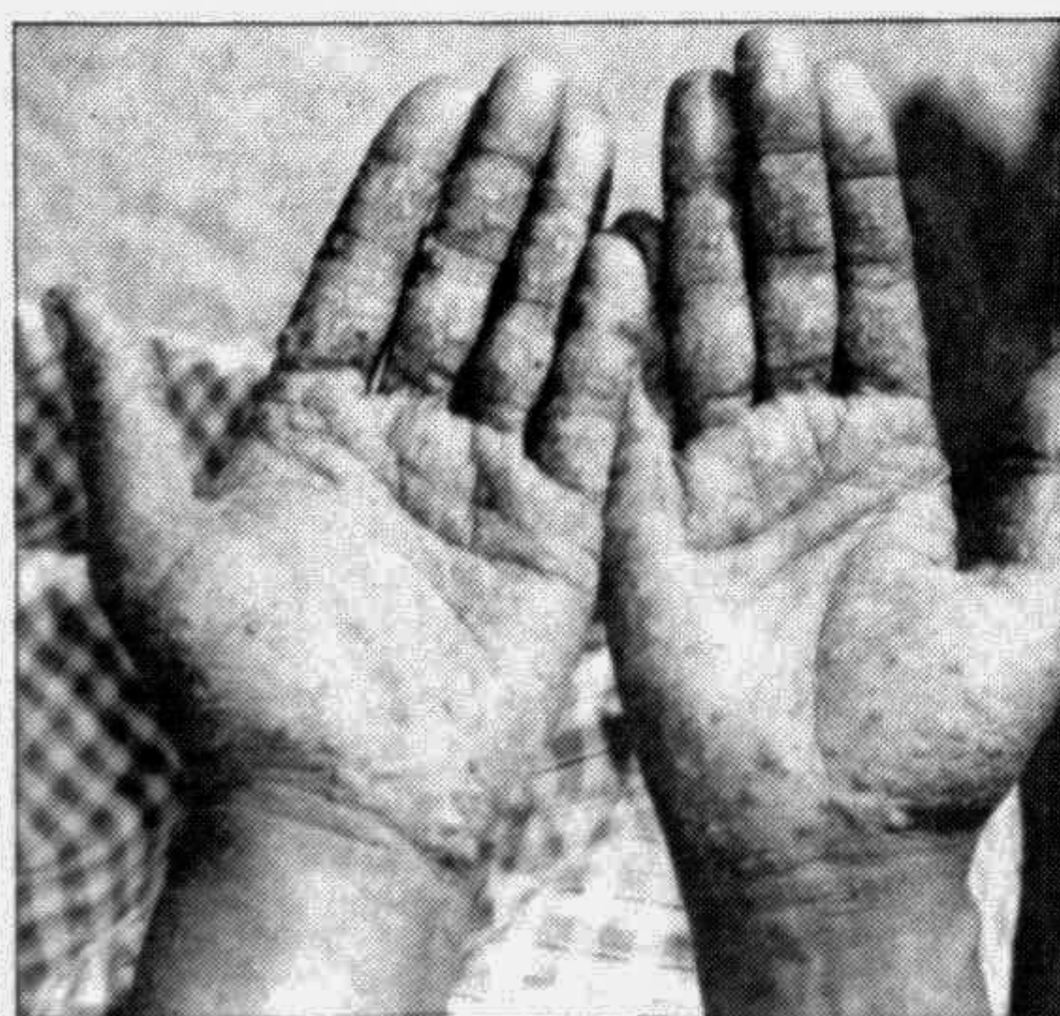
Hands of an arsenic patient in Faridpur.

The World Health Organisation (WHO) has expressed concern over reports of arsenic contamination in western Bangladesh and stressed analysing the situation in a comprehensive manner, reports UNB.