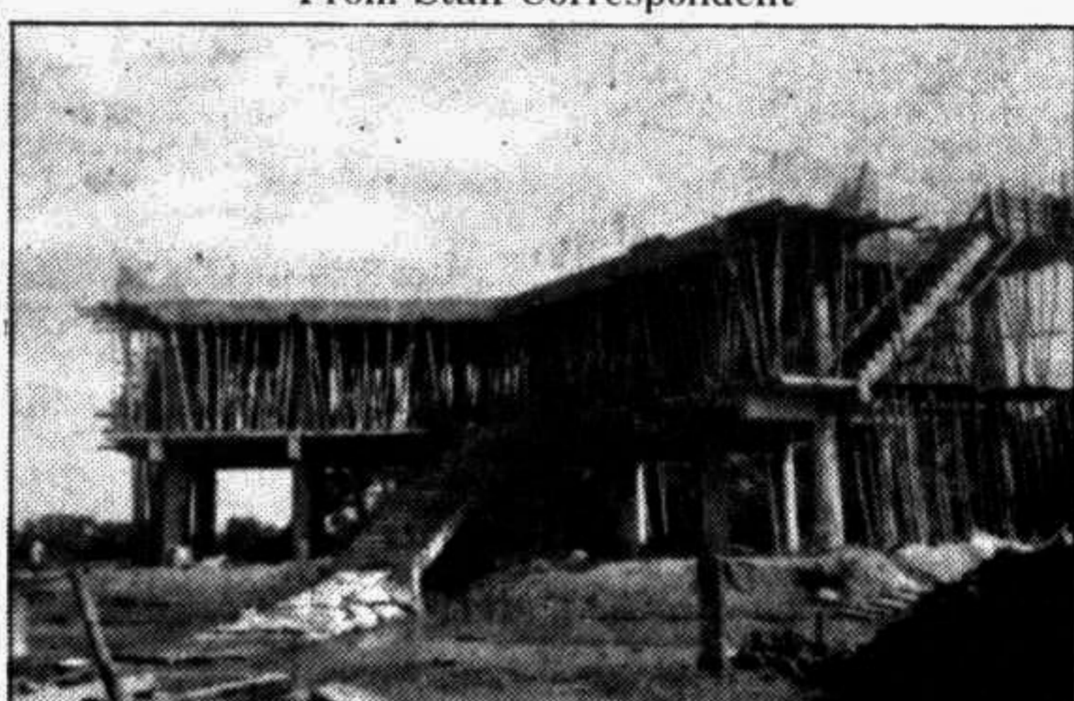
BARISAL: An under construction multipurpose cyclone shelter at Patharghata in Barguna district.

BARISAL, Jan 18: Nearly 40 riverine routes in the southern region likely to be left abandoned due to emergence of numerous shoals in the river Meghna during this winter dry season like the previous years.