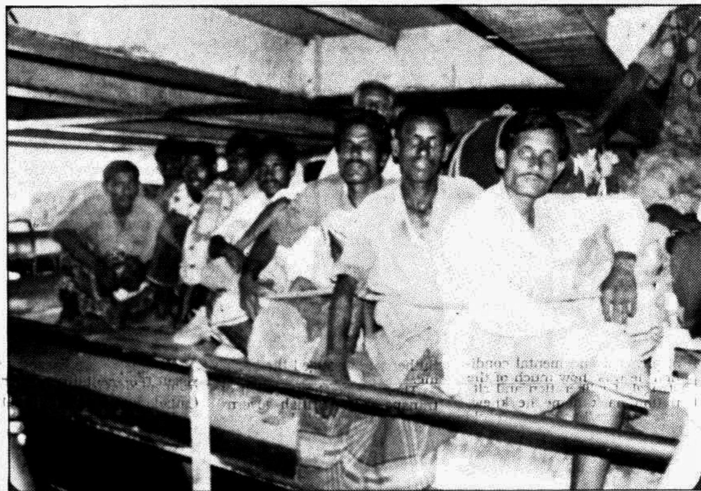
At first sight of this picture, it seems to the observers to be a group of undertrials who are being taken to a destination somewhere else. They are being carried on the roof of a bus by policemen not in the picture. But the reality is a bit different. Most of the buses plying from the northern region towards the capital city and vice versa carry overloaded passengers on roof resulting in frequent road accidents and death of valuable lives. The picture here shows, the overloaded bus on board ferry Enayetpuri carrying 20 extra passengers on roof. For the sake of their so-called 'safety' the supervisor of the bus has fastened them with a rope. But in fact how safe are those passengers? The authorities concerned are yet to take note of such very common sights on the northern region routes and take necessary steps.