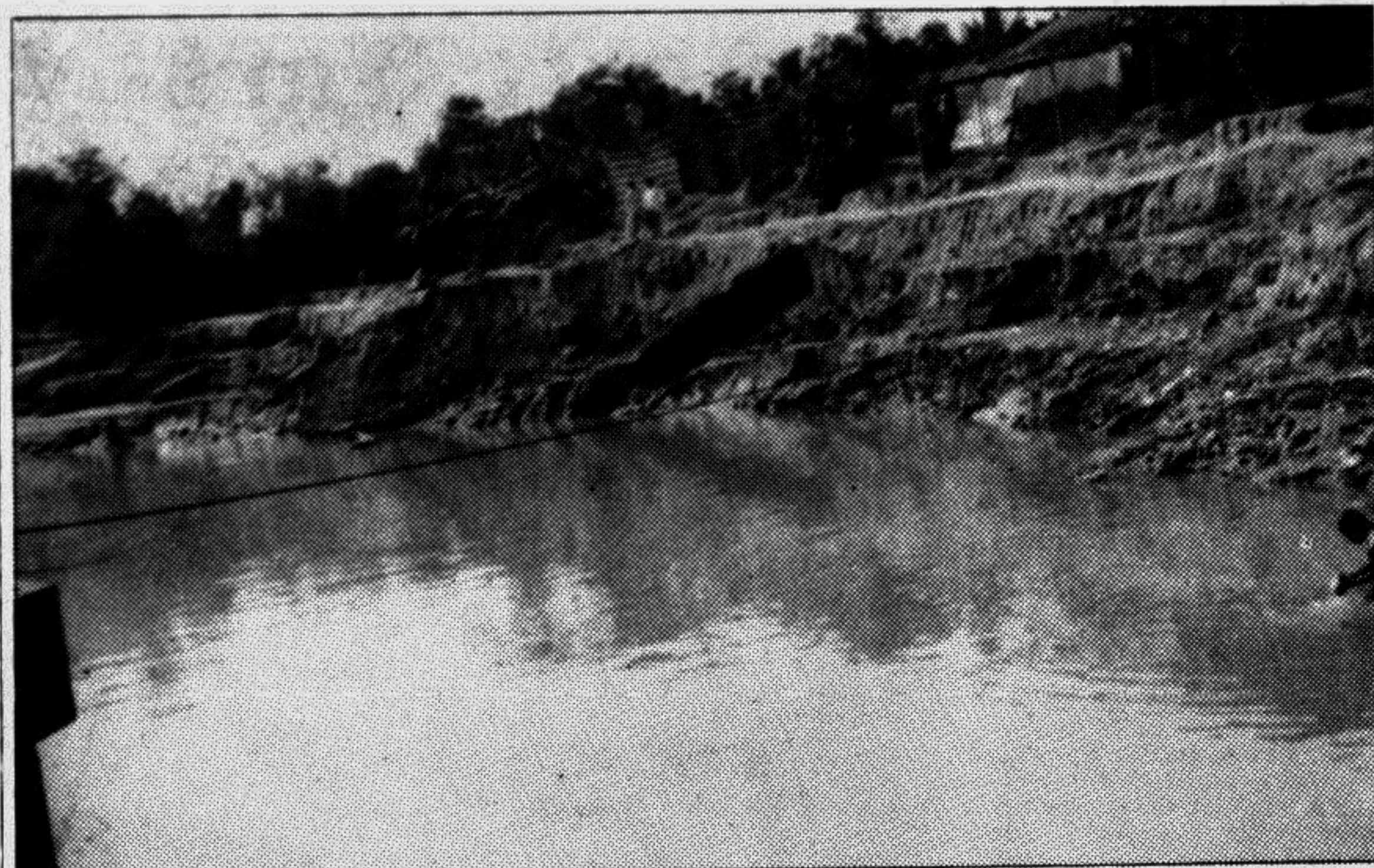
PANBA: Erosion of the river Jamuna near Pechakhola under Bera thana in the district