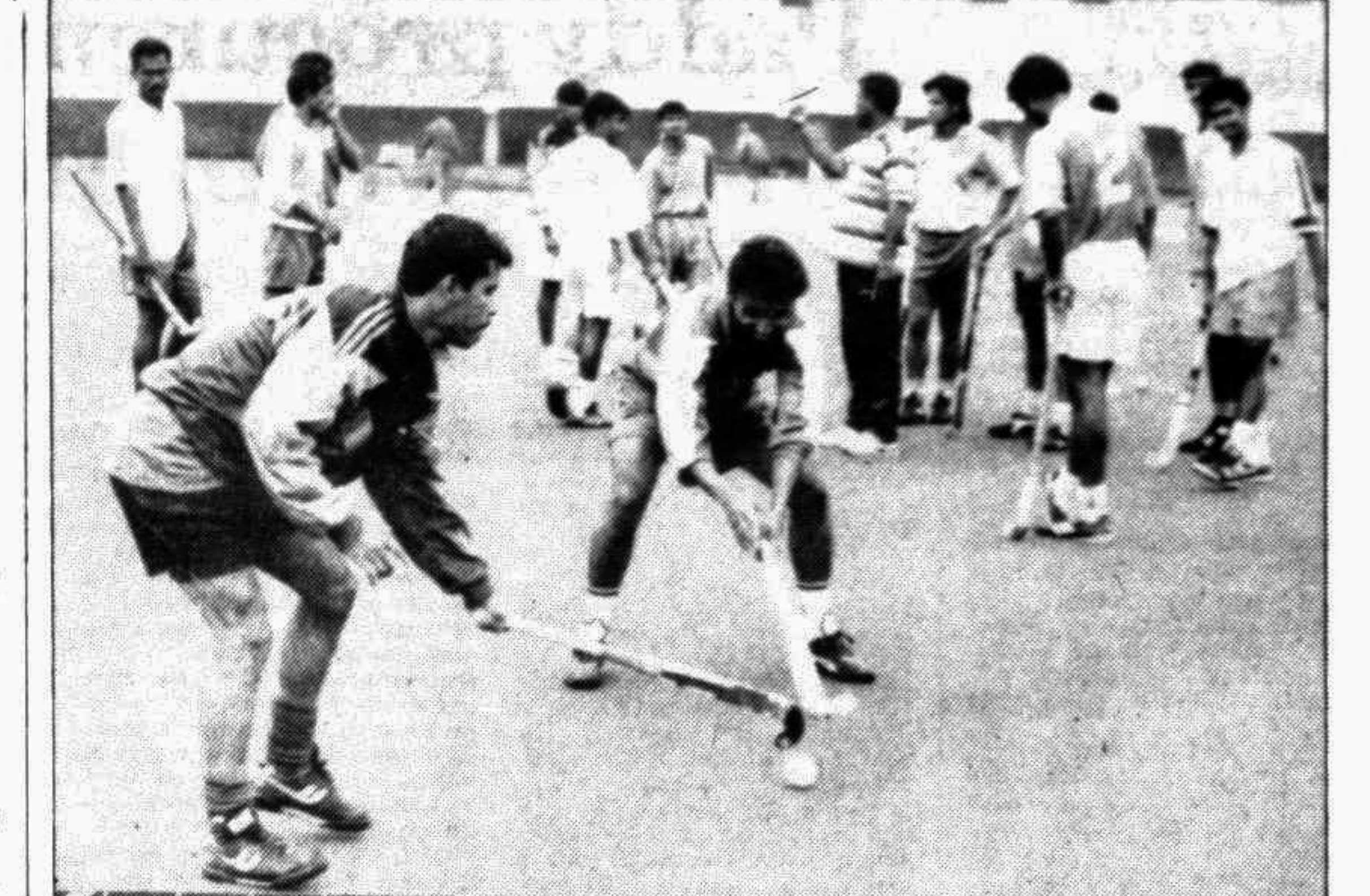
Mohammedan players practising at the National Hockey Stadium yesterday on the eve of the International Club tournament which begins in the capital tomorrow.

Interested coaches of the Dhaka metropolitan area will be eligible to attend the course.