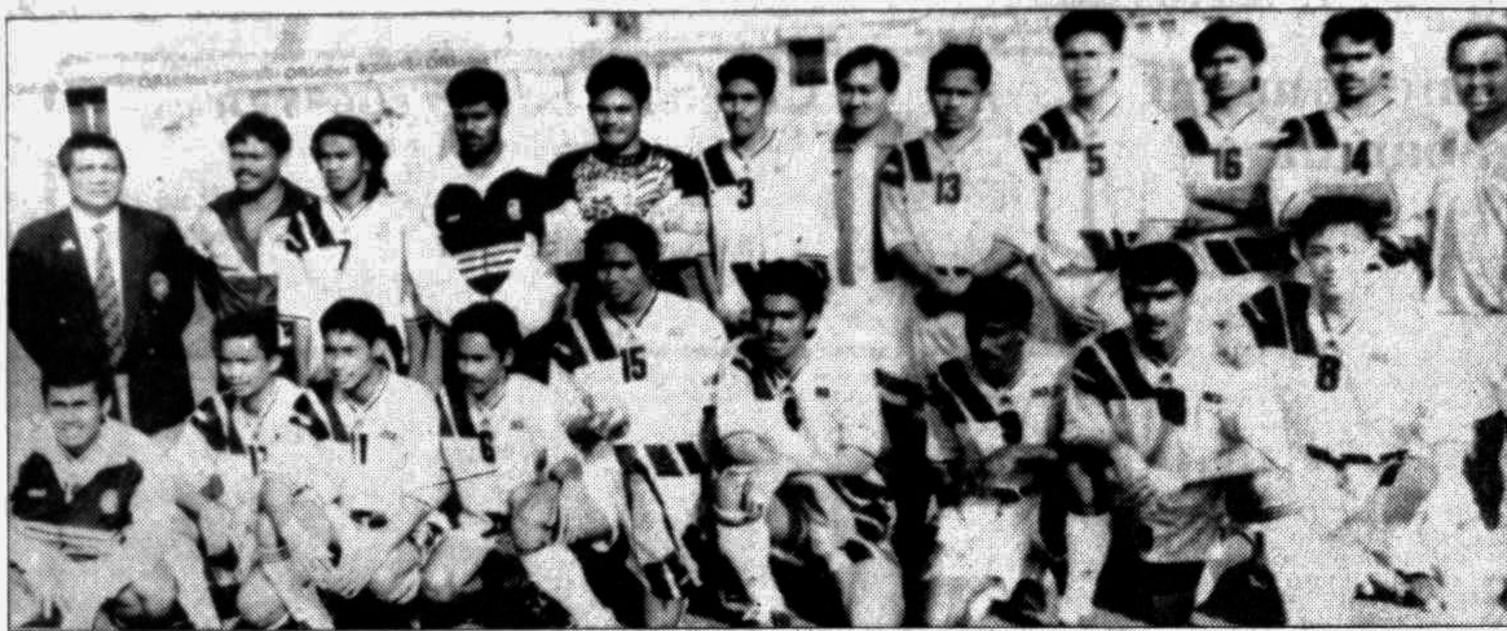
The Malaysian team who won the Bangabandhu Cup beating PSM Ujung Pandang of Indonesia in the final.