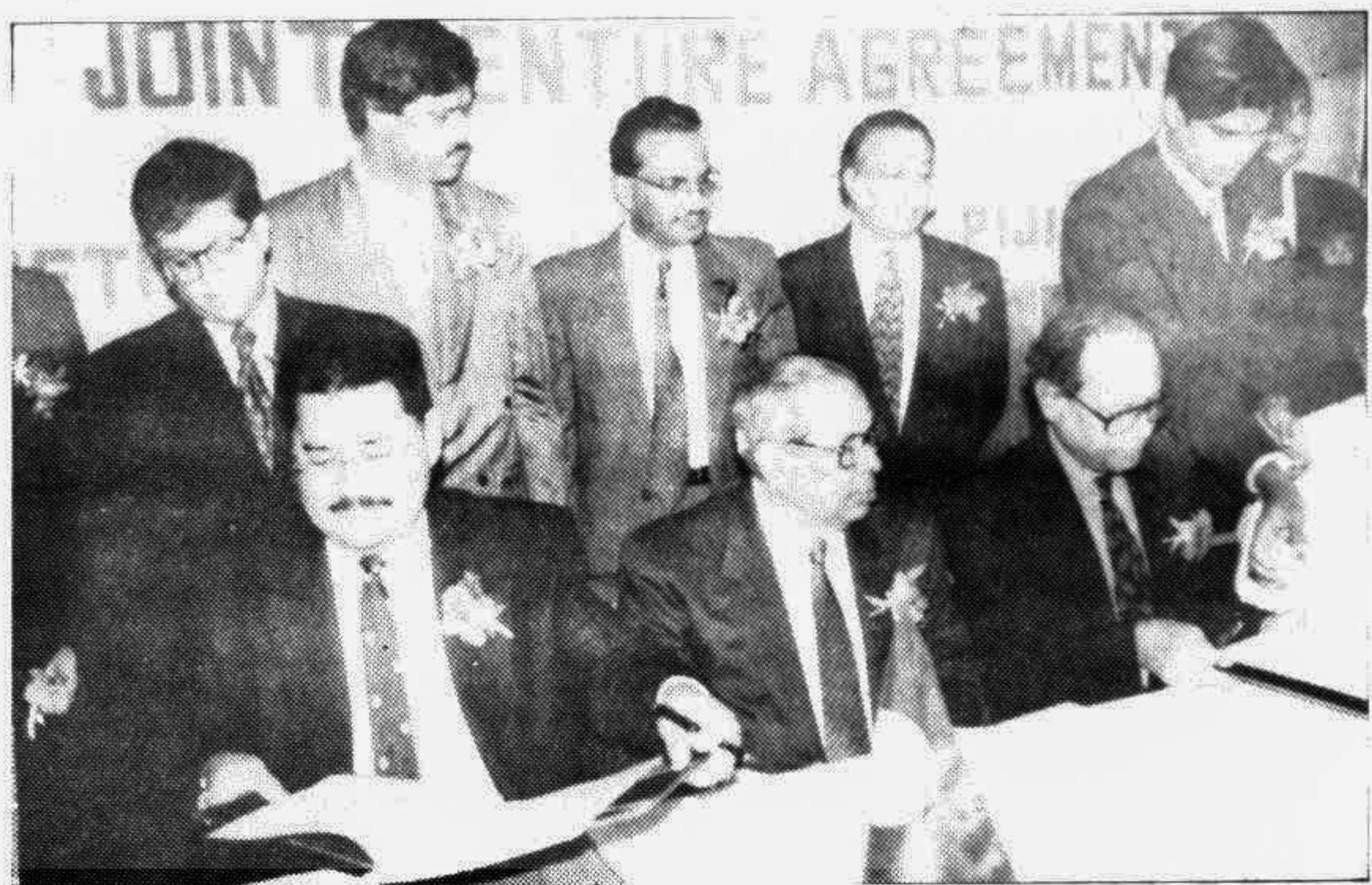
A joint venture agreement on LPG import and distribution was signed yesterday between Petro Arafah Ltd of Bangladesh and Elpiji Sdn Bhd of Malaysia. Finance Minister S A M S Kibria was the chief guest of the signing ceremony.

The 338 million yuan (40.7 million dollars) cable, will provide 24,570 telephone lines.