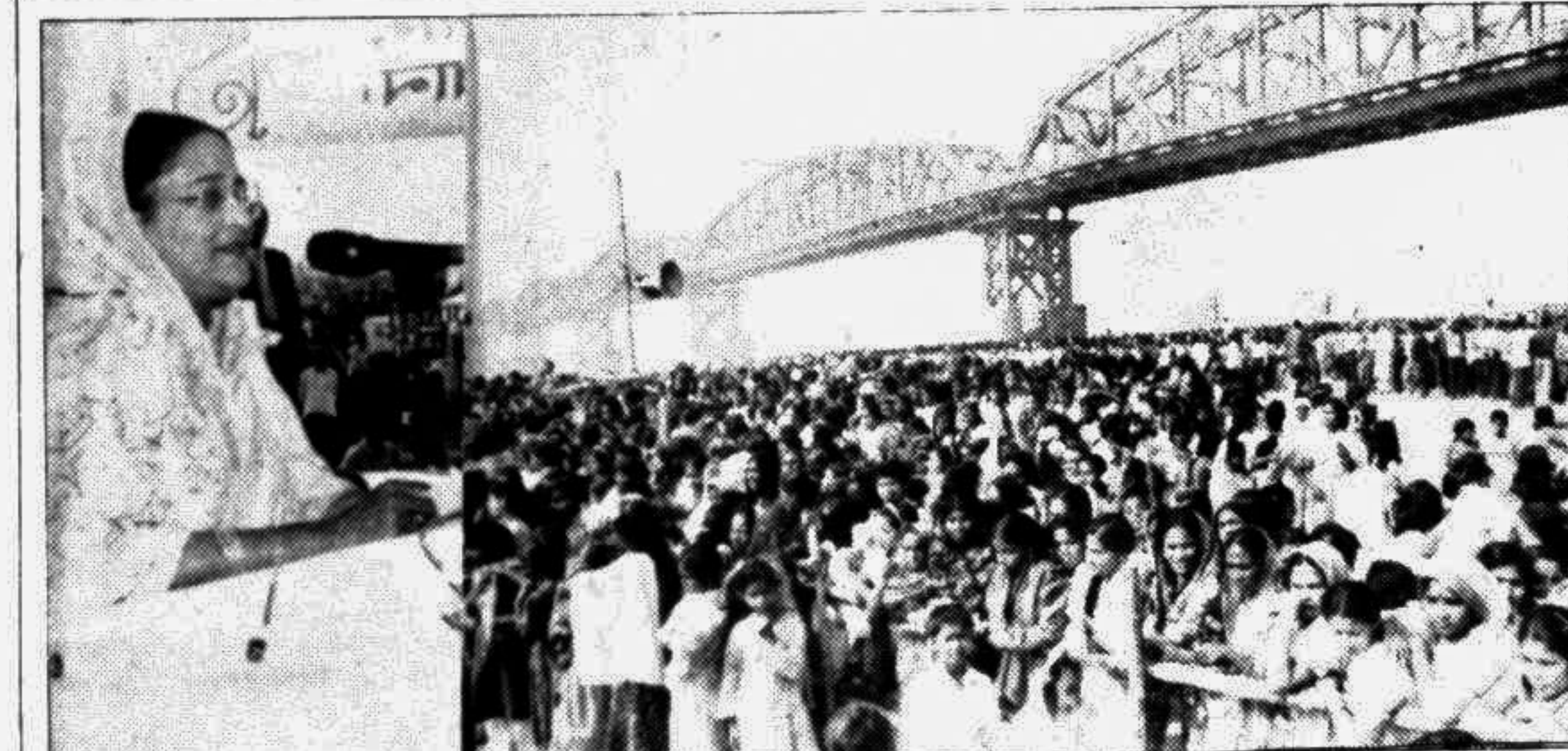
Prime Minister Sheikh Hasina addressing a big public meeting near the Hardinge Bridge at Pakshi yesterday.