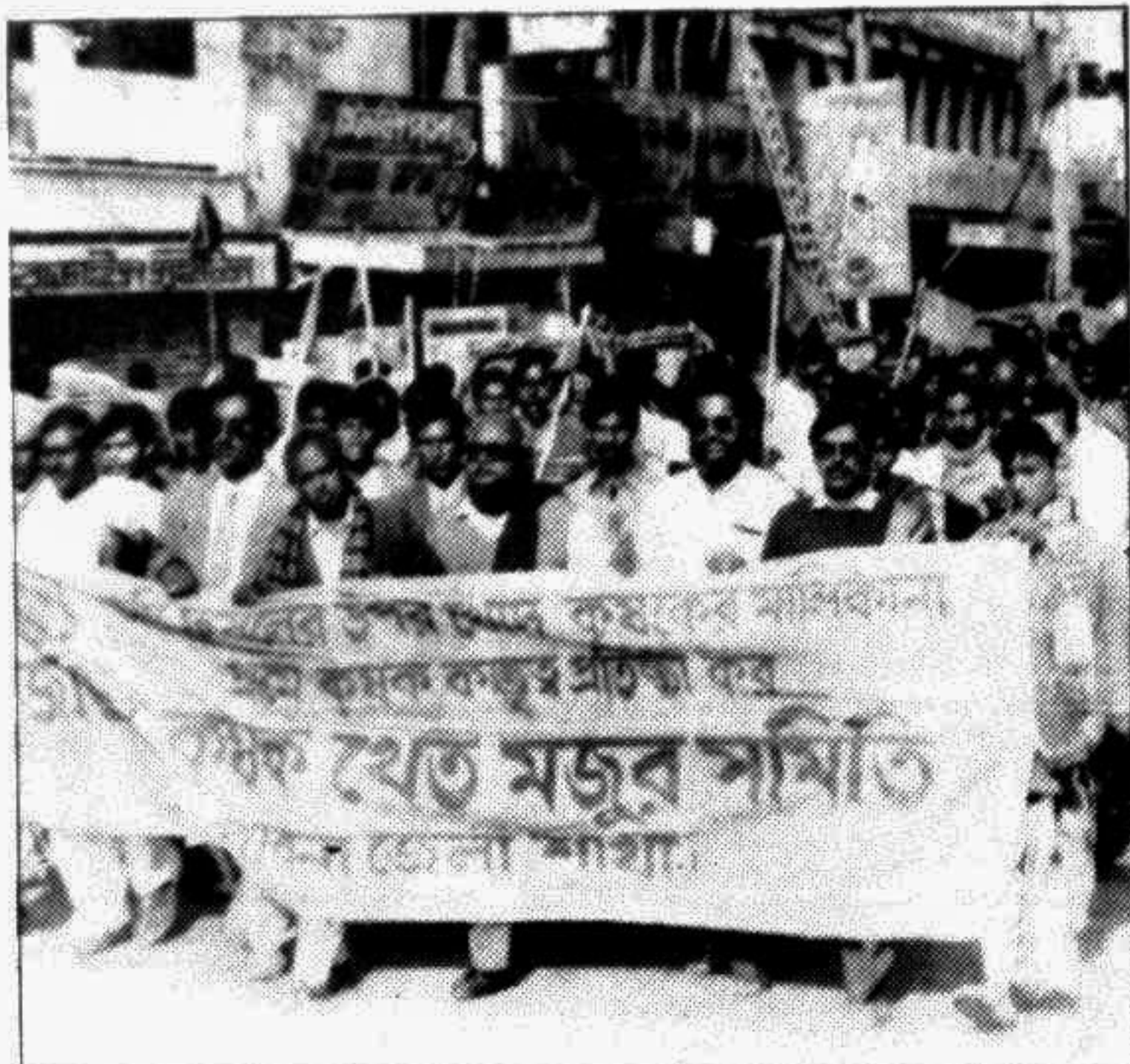
PABNA: A massive demonstration was brought by the Jatiya Krishak Khetmajor Samity Thursday in Pabna town on the eve of the meeting.

Meanwhile, the dacoits stopped a Barisal-bound passenger coach of 'Sakura Paribahan'. They also committed dacoities on two minibuses and a truck and looted the valuables.