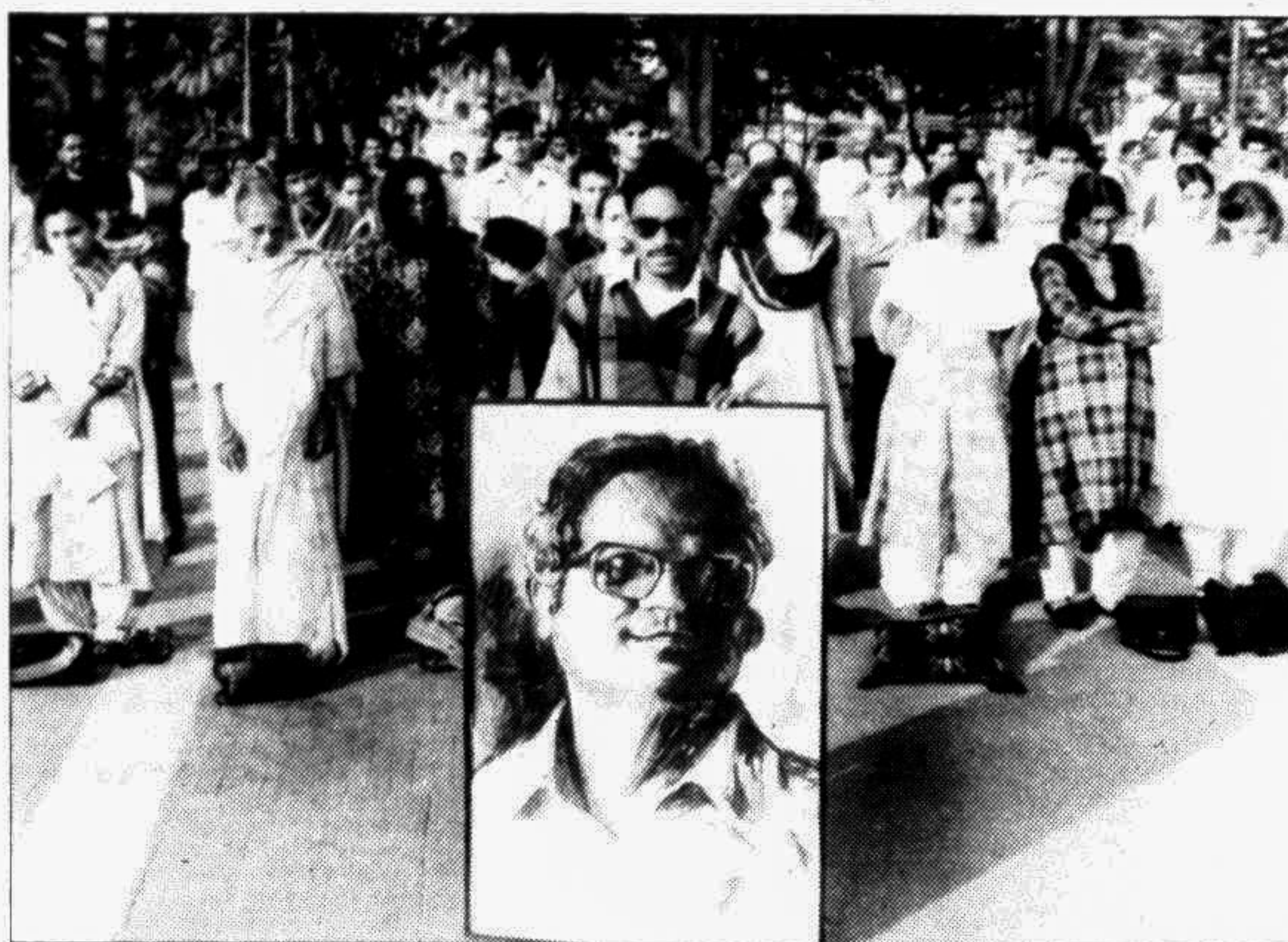
The Bangladesh Lekhak Shibir held a meeting in memory of litterateur Akhteruzzaman Elias at the Central Shaheed Minar in the city yesterday.