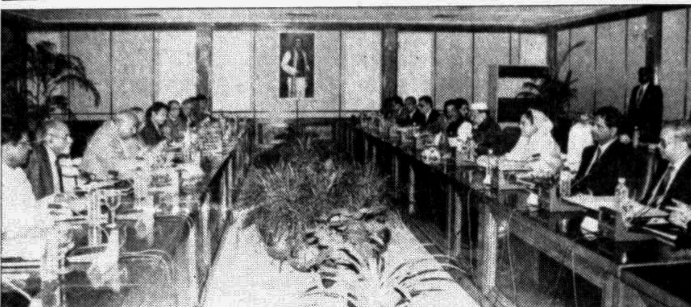
Prime Minister Sheikh Hasina and her Indian counterpart H D Deve Gowda at the Indo-Bangla official talks at the International Conference Centre in the city yesterday.

PLEASE CONTACT: BANGLADESH AIR EXPRESS INT'L LTD. Head Office: 9565114, Fax: 9565112, Gulshan: 887771, Chittagong: (031) 712127, Khulna: (041) 25008