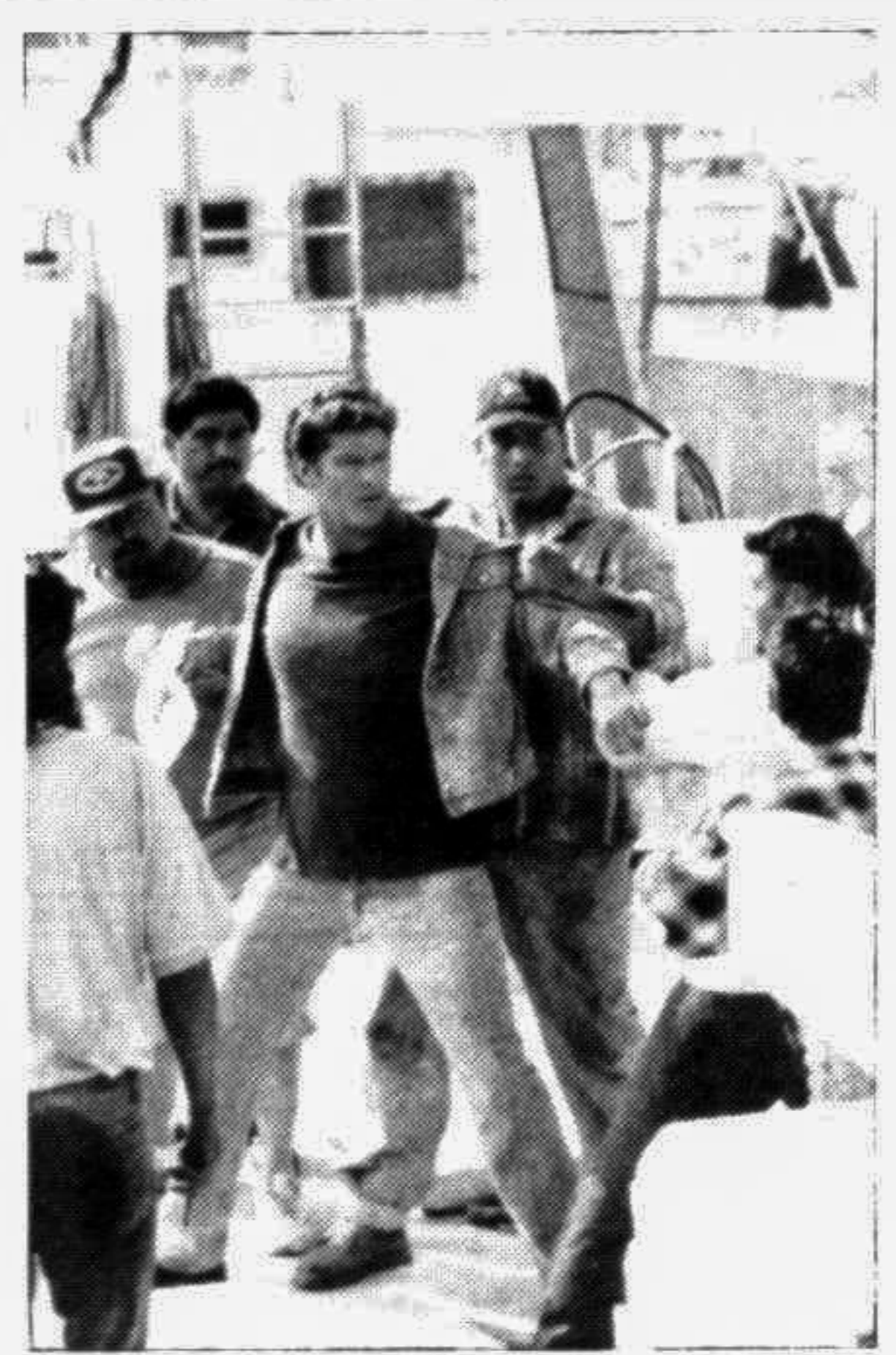
Baywatch Nights on Star Plus, Tonight at 1:00

BTV 3:00 Opening Announcement Al-Quran Programme Summary 3:10 News in Bangla 3:15 Patriotic songs 3:20 Recitation from the Gotta 3:25 The Album Show 3:50 Cartoon Film 4:15 Umesh 4:50 Coach 5:00 News in Bangla 5:22 Sangeta 6:00pm National Television Debate Competition 6:50 Open University 7:00 The News 7:25 Silver Jubilee of Freedom Fighter-A Documentary 8:00 News in Bangla 8:25 Silver Jubilee of Freedom Fighting-Mujibnagar Govt 9:00 Drama Serial: 10:00 The News 10:25 Those days of Freedom Fighting 10:30 sur Laharie 11:35 Wednesday's programme summary 11:40 Close down