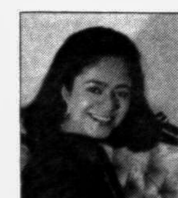
Dastan on Zee TV tonight at 11:30

STAR SPORTS 6:00am HK To Beijing Rally 6:30 Eisenhower Cup Day 1, 2 & 3 H/Ls Ft Philippines 7:30 India Tour Of South Africa India v S Africa 2nd Test Match Day 5 H/L 8:30 Trans World Sport 9:30 1996 Asian Club Championships East Asia Quarter Final Pohang Vs Yokohama Marinos 11:00 1996 Asian Club Championships East Asia Quarter Final Ilhwa Chunma Vs New Radiant 12:30 1996 Omega Tour Hugo Boss Foursumers H/Ls 1:30 India Tour Of South Africa India v S Africa 2nd Test Match Day 5 H/L 2:30 Indian Football National League Dempo Vs Salgoacar 4:30 Hu Trashion World Cup 5:30 Wild Bobsled Push Start Champs. H/L 6:00pm Futbol Mundial 6:30 Greatest Grand Slam Matches Of 1996 Chang vs Spadea & Sampas vs Corretja 8:30 ISU Skating Skate Canada 10:00 India Tour Of South Africa India v S Africa 2nd Test Match Day 5 H/L 10:30 HK To Beijing Rally 12:00 Prime Boxing 1:30 The Kickboxing Highlights 2:30 Wild Bobsled Push Start Champs. H/L 3:00 Calvert Centenary Expedition 4:00 International Motorsports News 5:00 ITU Triathlon World Cup-6