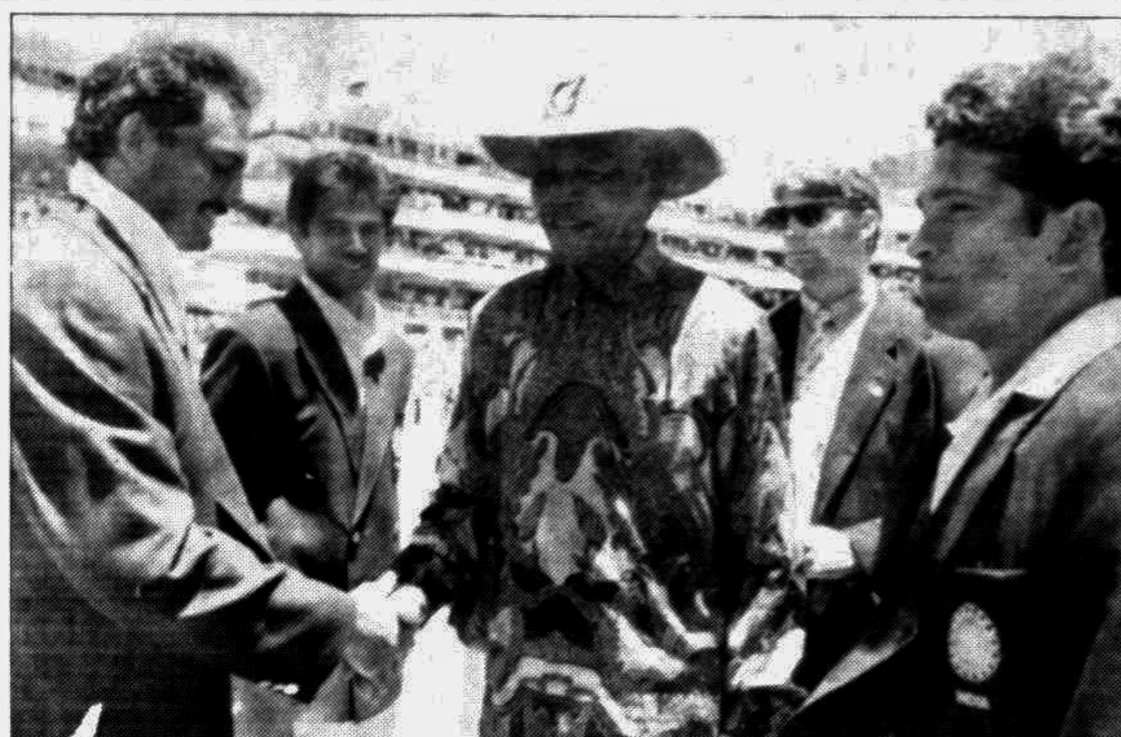
South African President Nelson Mandela (C) being introduced to Mohammad Azharuddin by the Indian captain Sachin Tendulkar (R) during the lunch break on the third day of the second Test at Newlands, Cape Town on Jan 4.

Courier, playing in Doha for the first time, had lost to Bruguera in their last two matches, but this time 26th ranked Courier, controlled the match from start to finish to book his passage.