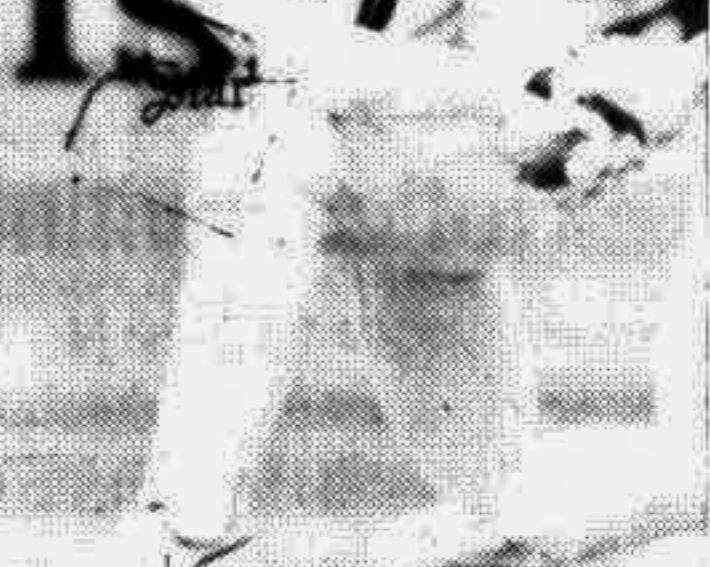
HOOPER ... m-o-m

It was the second highest successful chase in one-day games in Australia, after New Zealand's 297 for six to beat England at Adelaide in 1982-83, and gave the Windies a six-nil record over Australia in Brisbane.