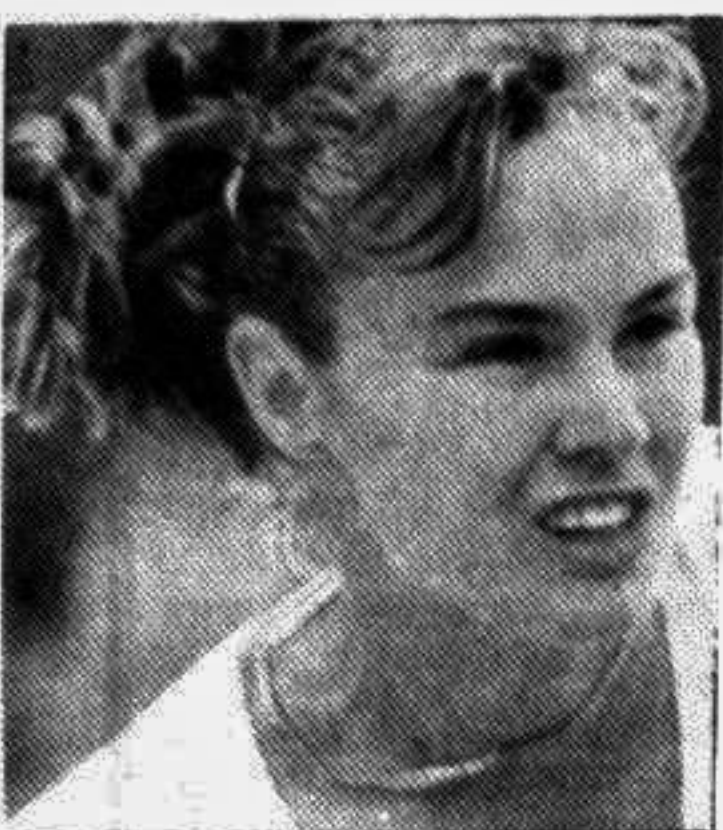
Martina Hingis (Swiss tennis player) "I wanted to be a model when I was young, but I wasn't talented enough. I would like to do some commercials. I like the glamour on the court."

WIN TK, 2000/- PRIZE BOND EVERY FORTNIGHT