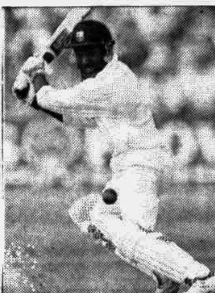
LARA ... 102

Result: West Indies won by seven wickets. Man-of-the-match: Carl Hopper.