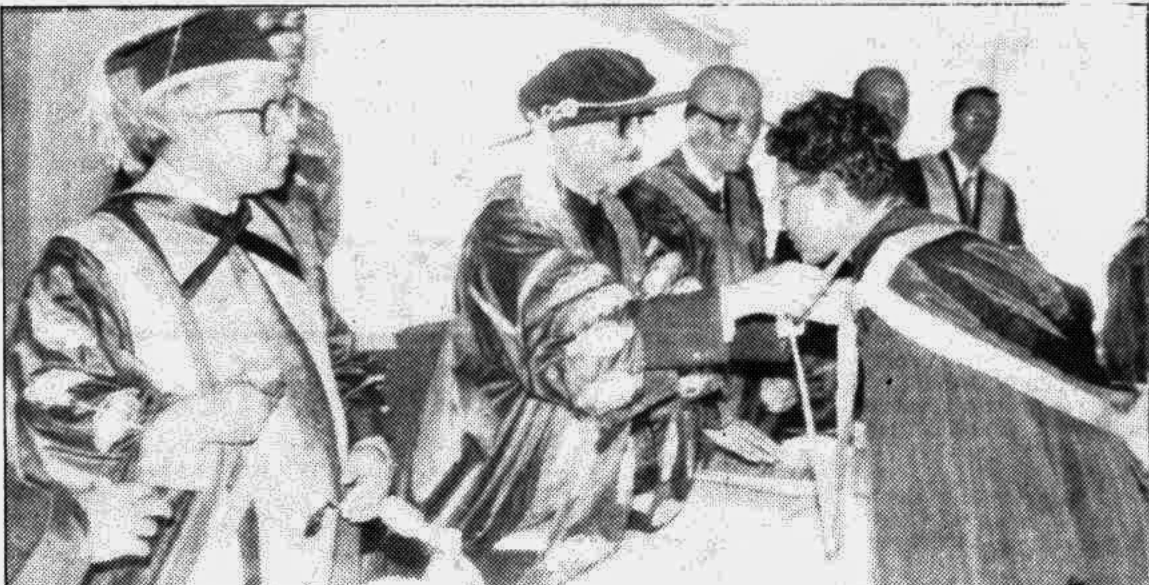
President Shahabuddin Ahmed presenting gold medal to a graduate student at the convocation of Jahangirnagar University on its campus in Savar yesterday.