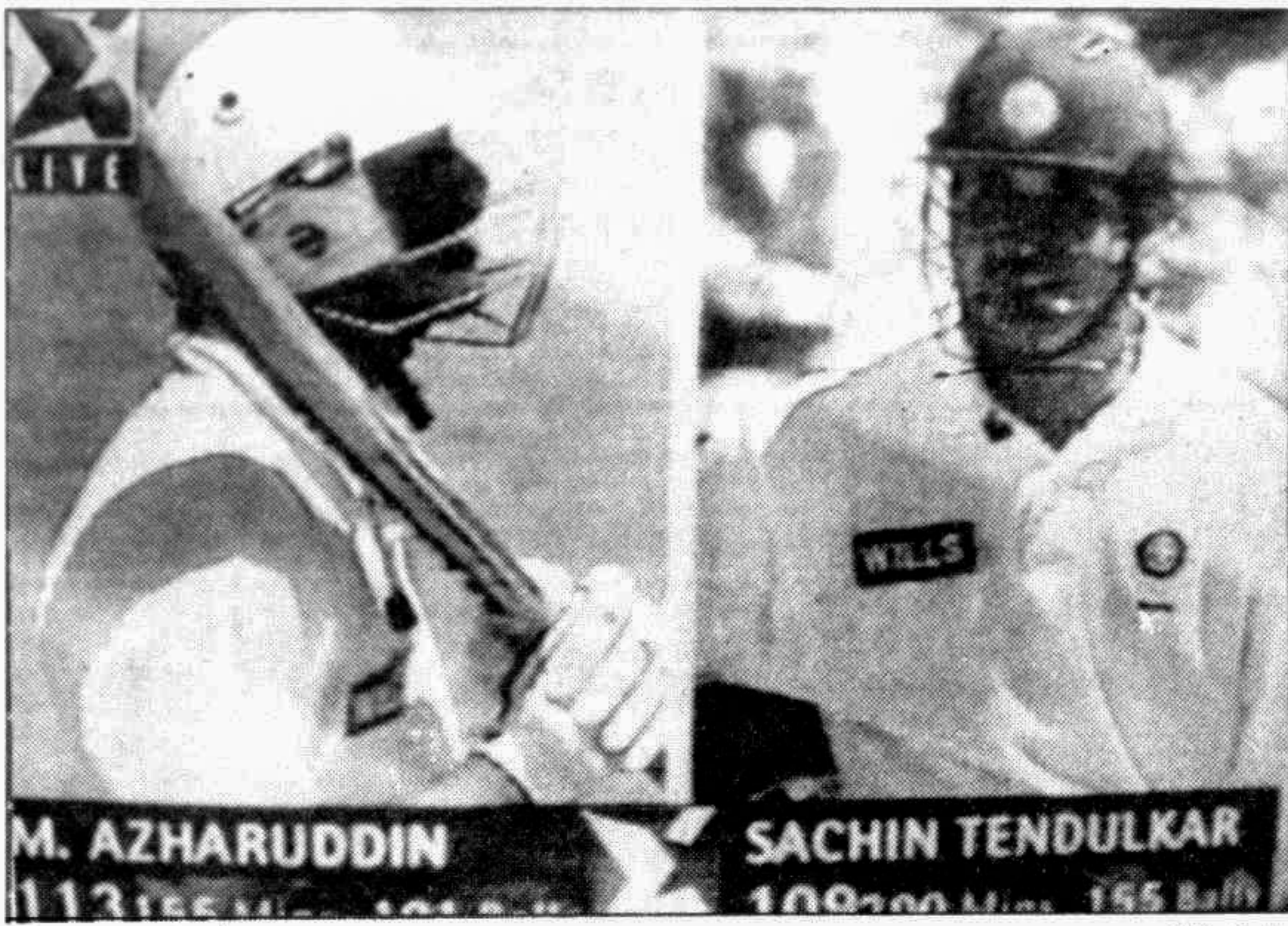
The two-centurions.