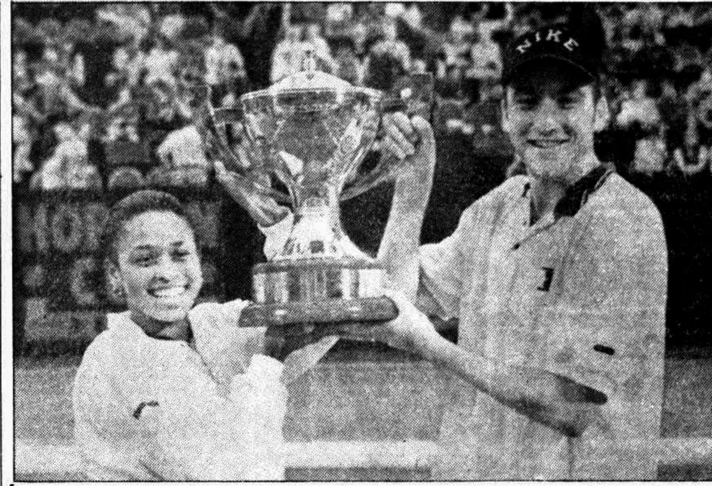
Americans Chanda Rubin (L) and Justin Gimelstob show off the Hopman Cup trophy after beating Amanda Coetzer and Wayne Ferreira of South Africa in the final in Perth, Australia yesterday. The Americans won the mixed doubles 3-6, 6-2, 7-5 to clinch the title after the singles stood at 1-1.