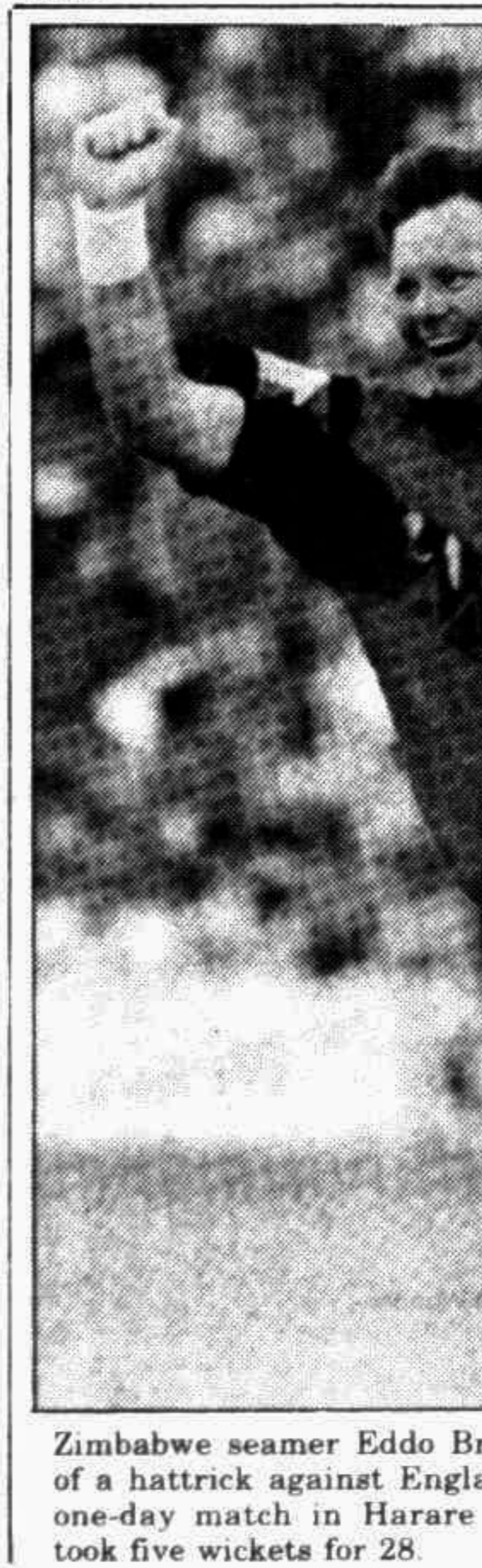
Zimbabwe seamer Eddo Brandes in ecstasy on completion of a hat-trick against England during their third and final one-day match in Harare on Jan 3. Brandes eventually took five wickets for 28.