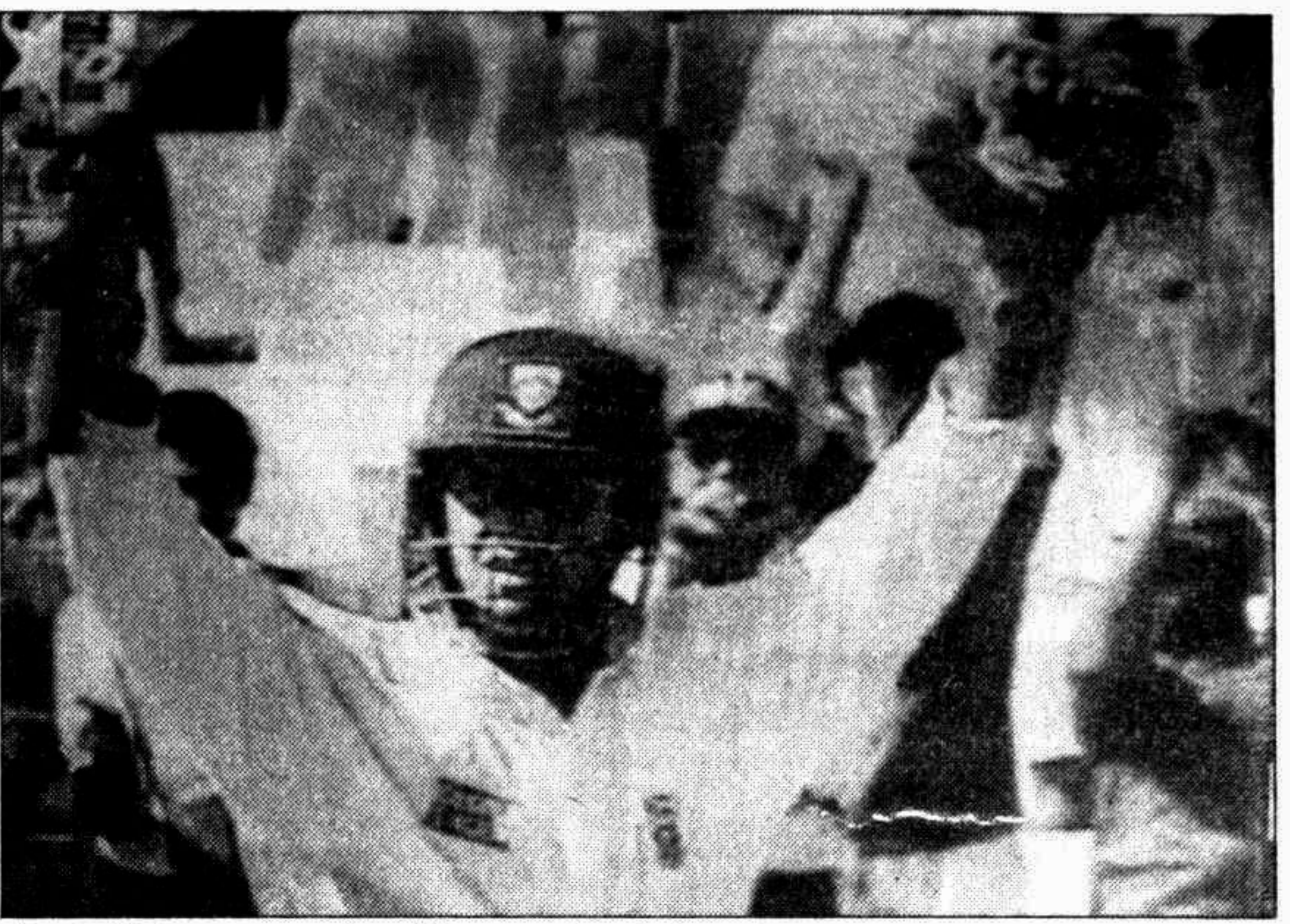
South African opener Gary Kirsten acknowledges the crowd's applause after scoring a hundred against India during first day's play of the second Test in Cape Town yesterday.

CAPE TOWN, South Africa, Jan 2: South Africa were 280 for four and in a strong position at the close of the first day of the second Test against India today, reports AP. South Africa were helped not only by a superb 103 by opening batsman Gary Kirsten and sparkling 77 by middle-order batsman Daryll Cullinan, but also by some sloppy fielding and poor close-to-the-wicket catching by India. Kirsten, who scored his fourth Test century and his second against India, was dropped on naught by Mohammad Azharuddin in the slips, and then on 10 by Anil Kumble in the gully. On both occasions the bowler was Venkatesh Prasad, the tall swing bowler who managed to retain his composure and line and length to finish the day with figures of 20-1-74-2. Both his victims, Andrew Hudson (16) and Cullinan (77) were caught behind by wicket-keeper Nayan Mongia. When stumps were drawn after the regulation 90 overs, South African Capt. Hansie Cronje and allrounder Brian McMillan were not out on 35 and 13 respectively. Now after the 328-run demolition of India in Durban in less than three days, South Africa hope to amass as many runs as possible to put themselves in an unbeatable position and take a 2-0 lead in the three-Test home series.