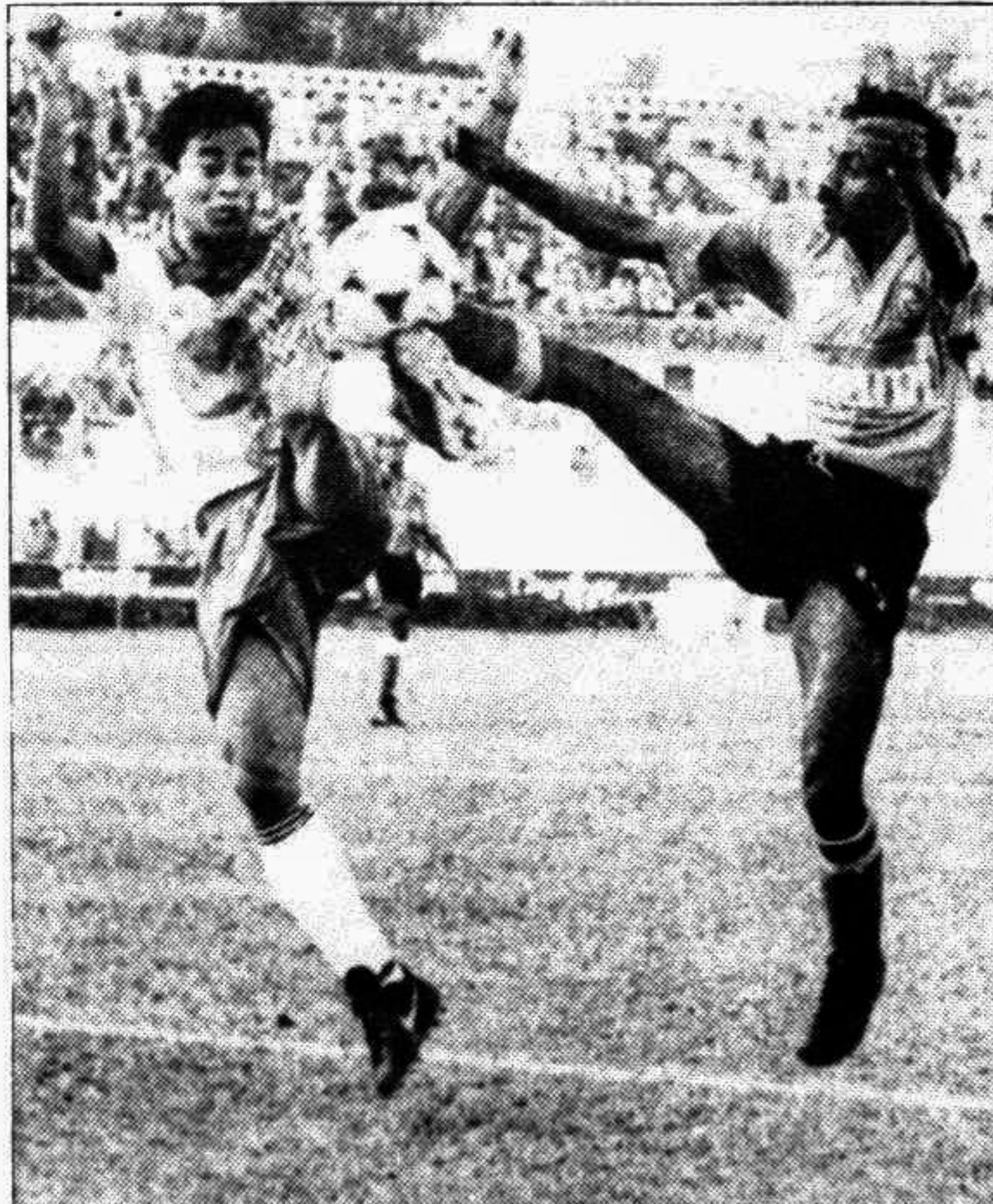
Rival booters lock in an aerial tussle for the possession of the ball during a Group C match of the Bangabandhu Cup...

Nepal's Friends Club and Bargh Shiraj Football Club of Iran won their respective matches of the Bangabandhu Cup Silver Jubilee of Independence Football Tournament held at the Dhaka Stadium yesterday.