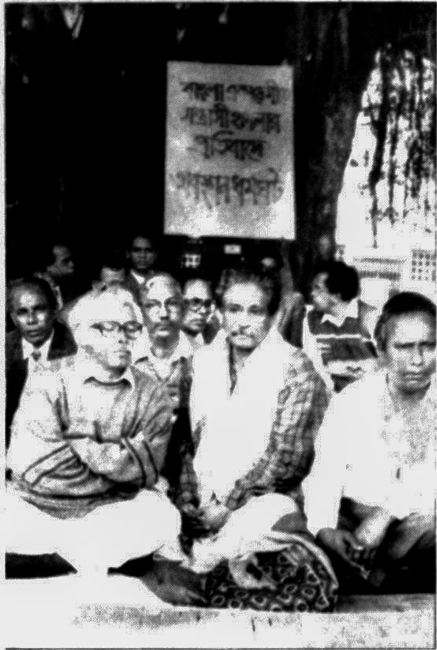
Members, officials and staff of the Bangla Academy yesterday staged a sit-in on the Academy compound protesting ransacking of some rooms at the Academy on Saturday.

By Staff Correspondent The officers and employees of Bangla Academy yesterday decided to observe work abstention and wear black badges from morning to noon everyday in all units of the Academy till the punishment of the attackers.