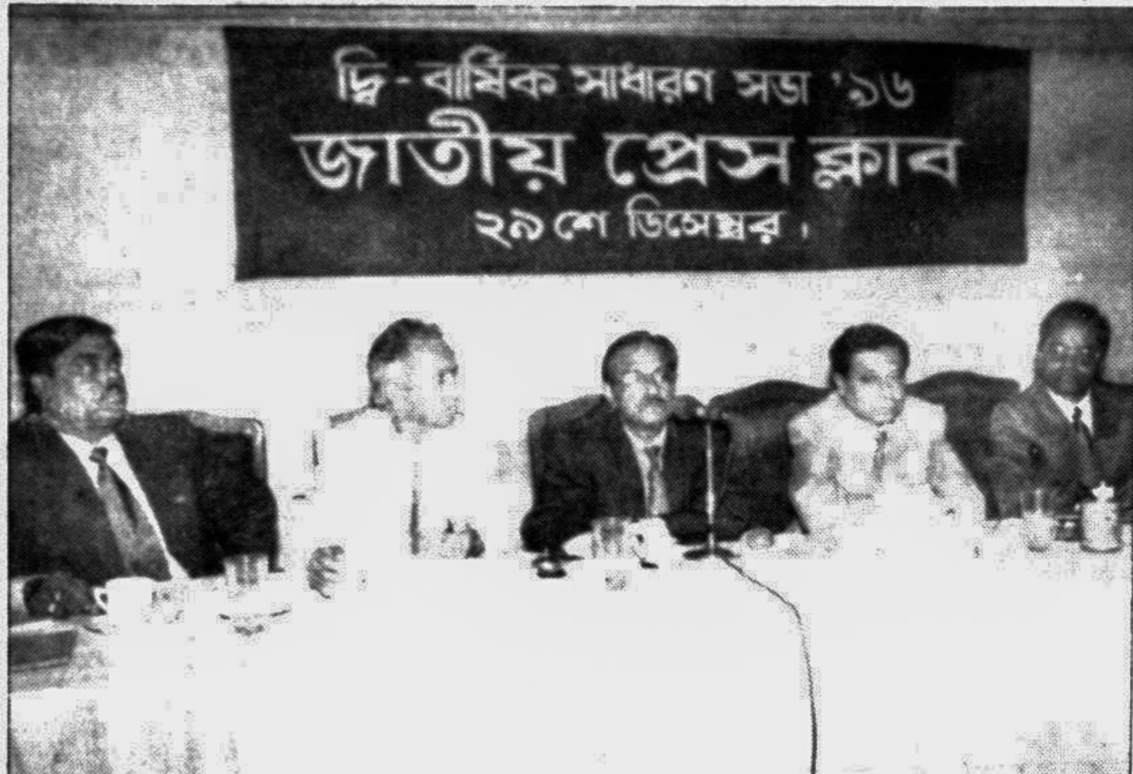
The Biennial General Meeting of the Jatiya Press Club began yesterday.

There was no word on what caused the sinking of the 15,022 deadweight tonne Jahan, built in 1972, registered in Belize and operated by Seatinnes Shipping of Singapore.