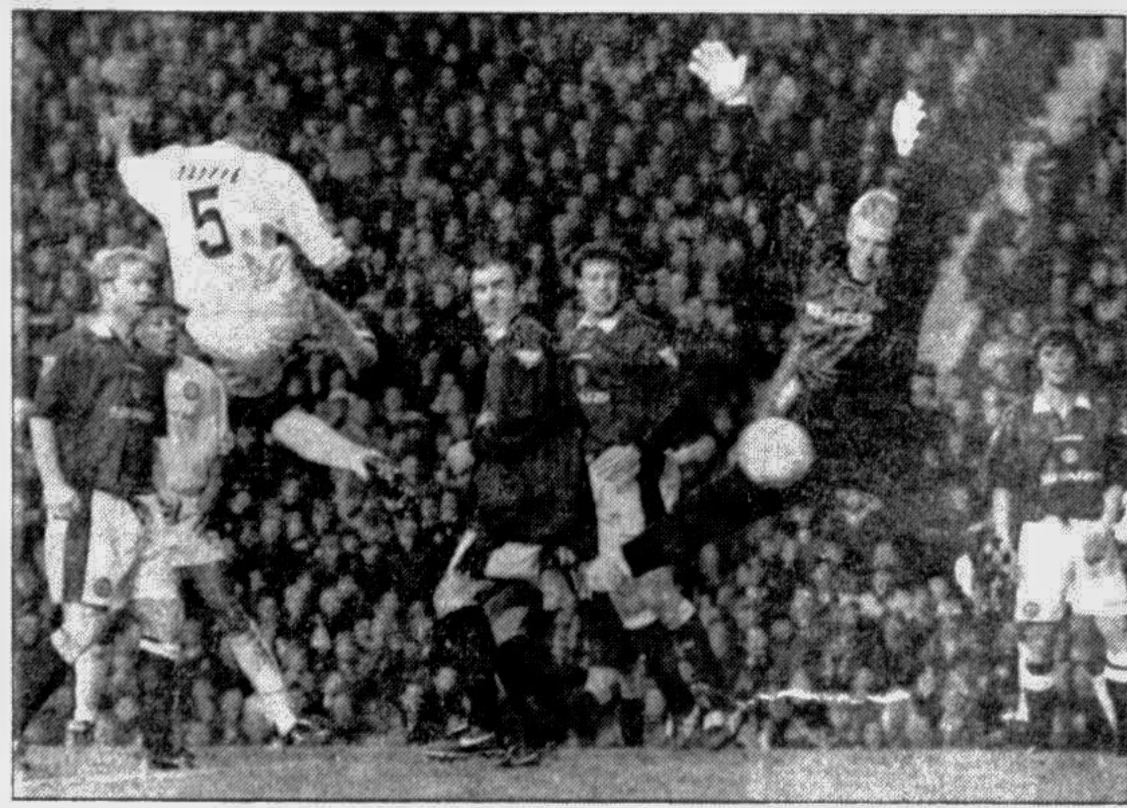
A goalmouth melee during an English Premier league match between Manchester United and Leeds United at Old Trafford on Dec 28. Manchester won 1-0.

Robson, a former England coach who took charge in the summer, has come in for increasing criticism from disgruntled fans with Barca third in the table after losing to Real Madrid three weeks ago, a defeat which left their bitter rivals four points clear of the Catalan giants.