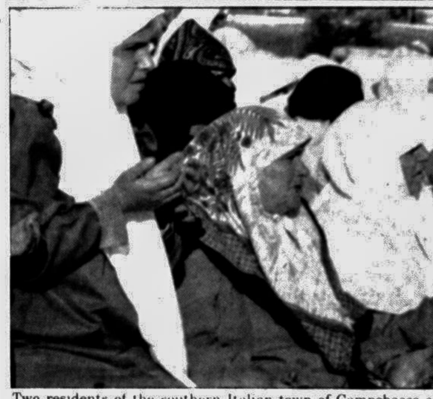
Two residents of the southern Italian town of Campobasso shovel snow to free their car as temperatures plunged to minus two degrees Celsius Saturday...