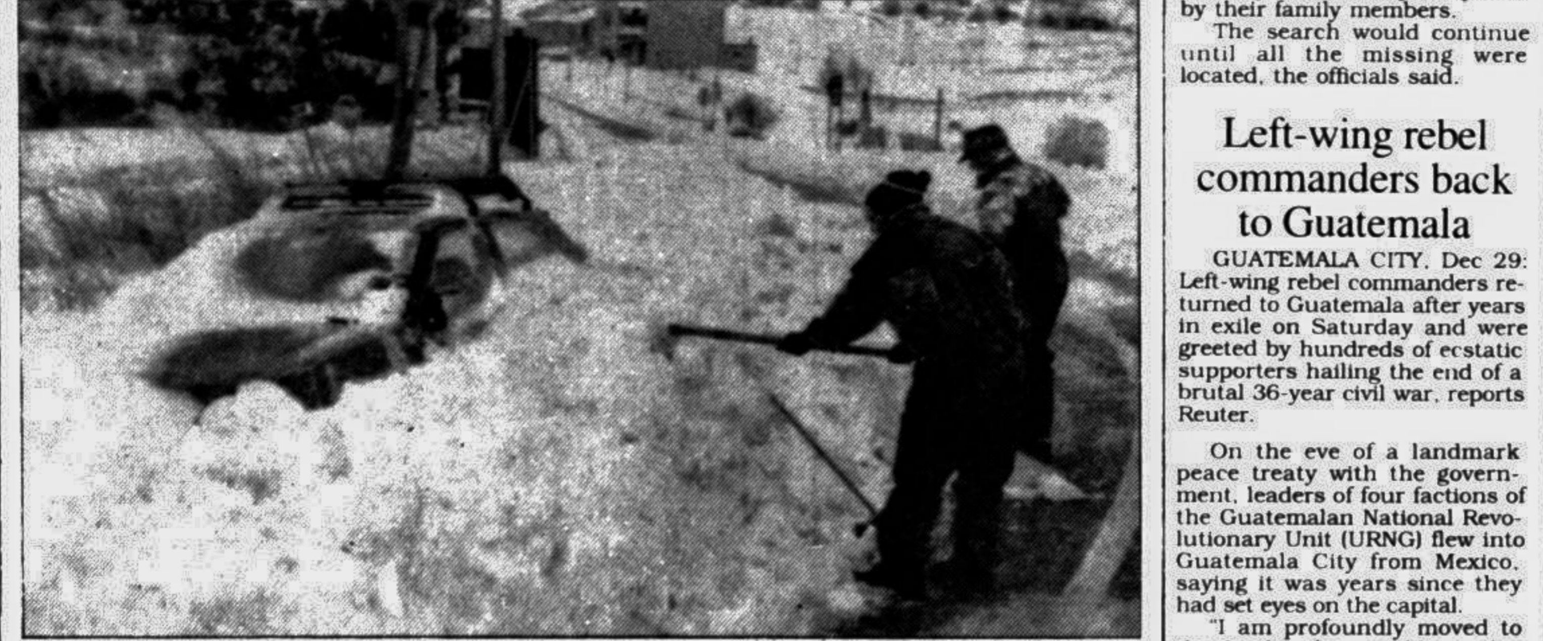
A group of Jordanian women participate in rain prayer in Amman on Saturday. Around 4000 participants gathered to attend the prayer which was called by the government to ask for rainfall which is the country's main source of water...