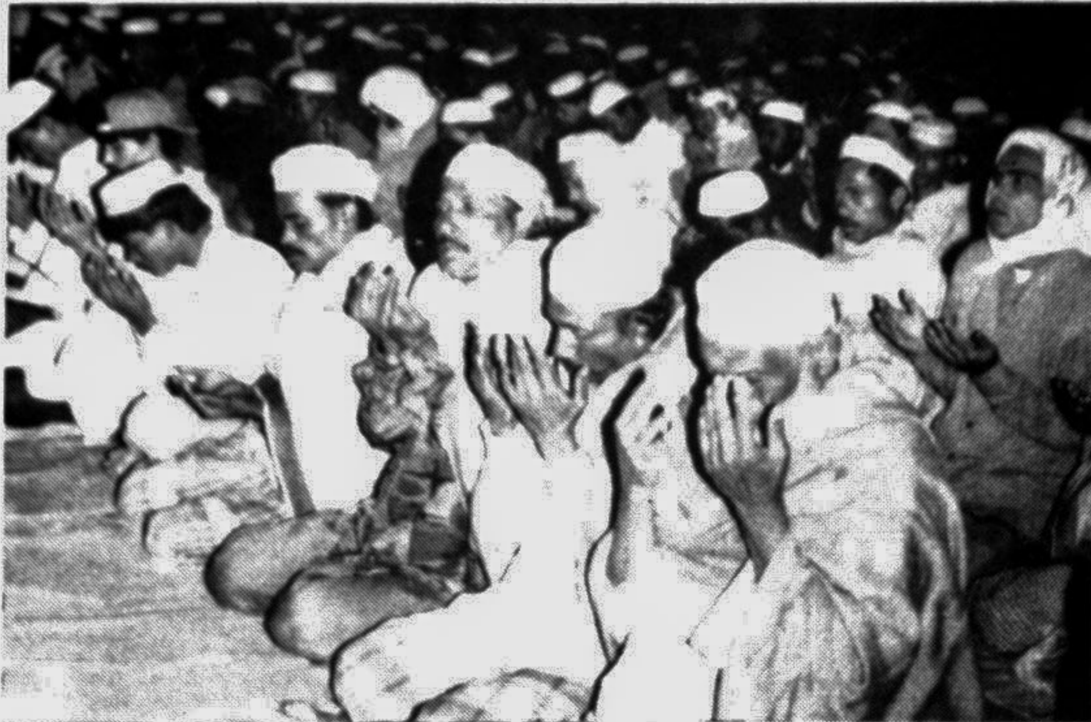
Devotees offering munajat at the Baitul Mukarram Mosque on the occasion of holy Shab-e-Barat on Thursday night.