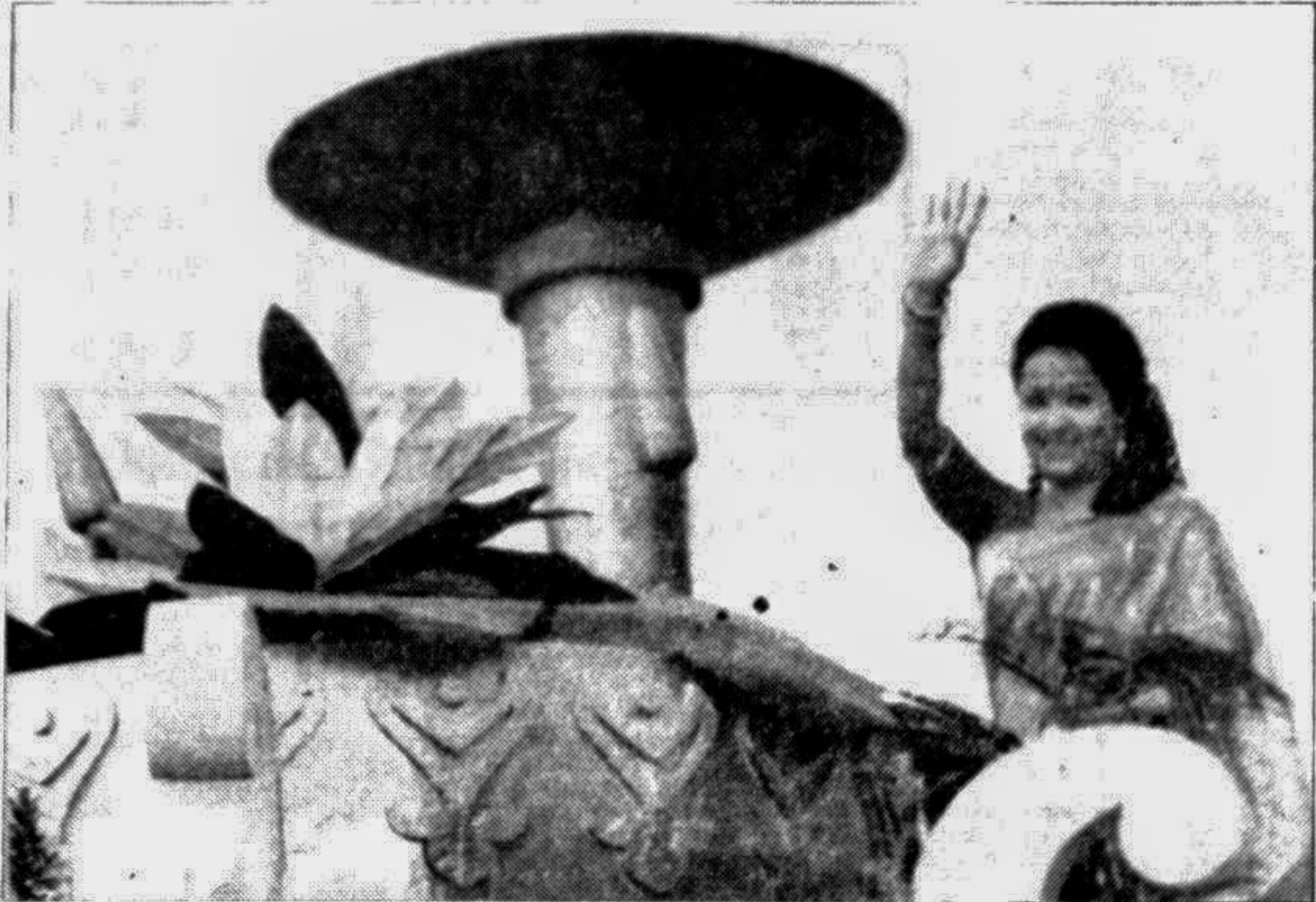
Noted singer Abida Sultana singing the closing song of the Sixth Bangladesh Games at the Dhaka Stadium yesterday.