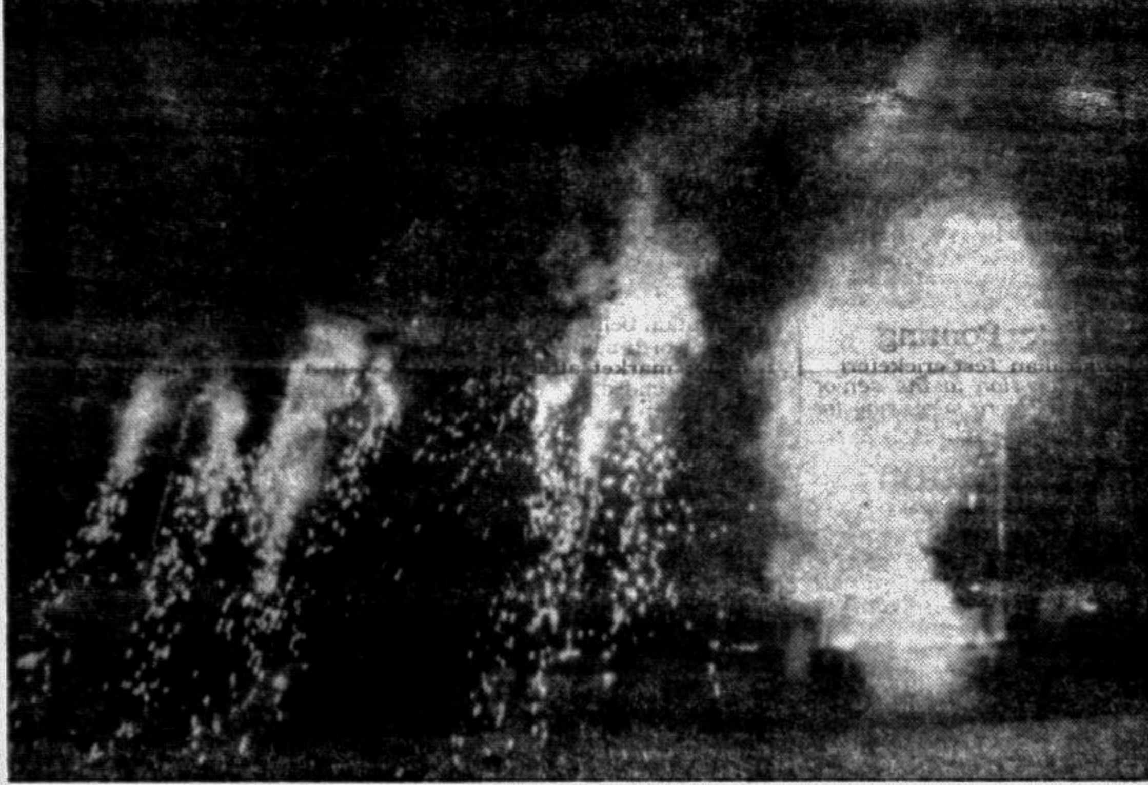
A scene of the colourful fire works during the closing ceremony of the Sixth Bangladesh Games at the Dhaka Stadium yesterday.

thousand spectators visited the entry-free arena. This is certainly a disappointing revelation at the end of the day for the NSC chairman whose unwisdom play to attract a full-house eventually backfired.