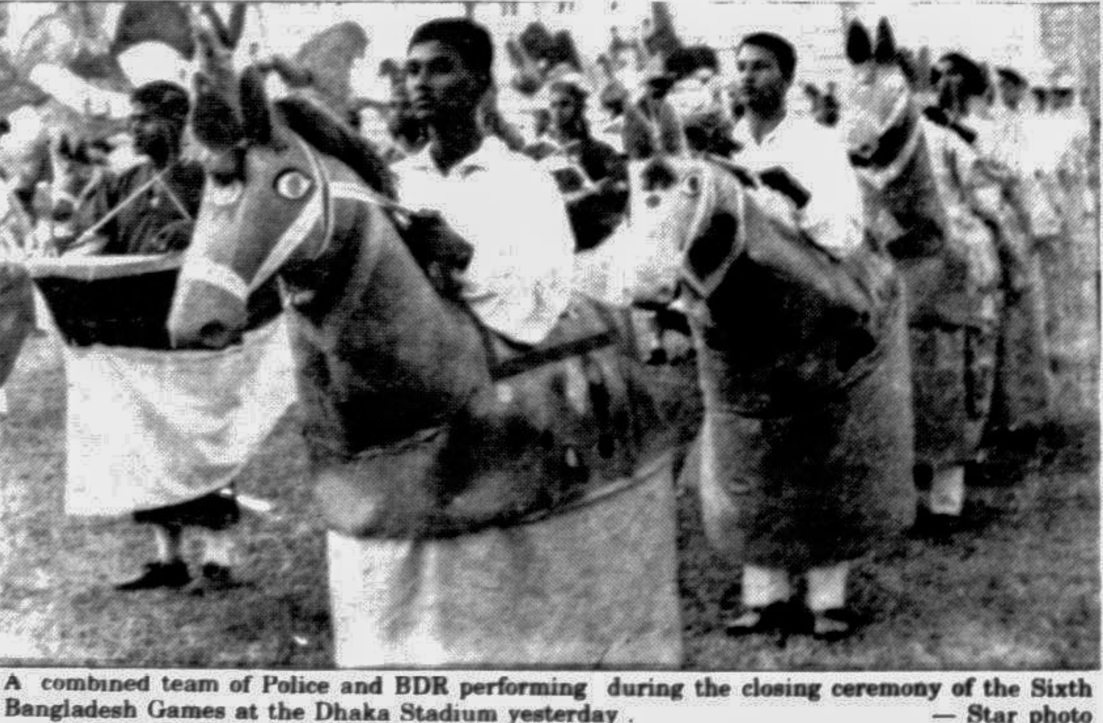
A combined team of Police and BDR performing during the closing ceremony of the Sixth Bangladesh Games at the Dhaka Stadium yesterday.