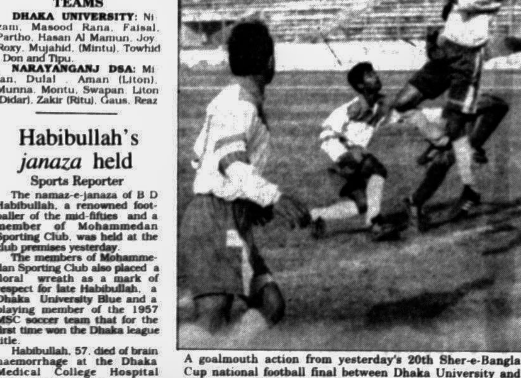
A goalmouth action from yesterday's 20th Sher-e-Bangla Cup national football final between Dhaka University and Narayananga DSA at the Mirpur Stadium.