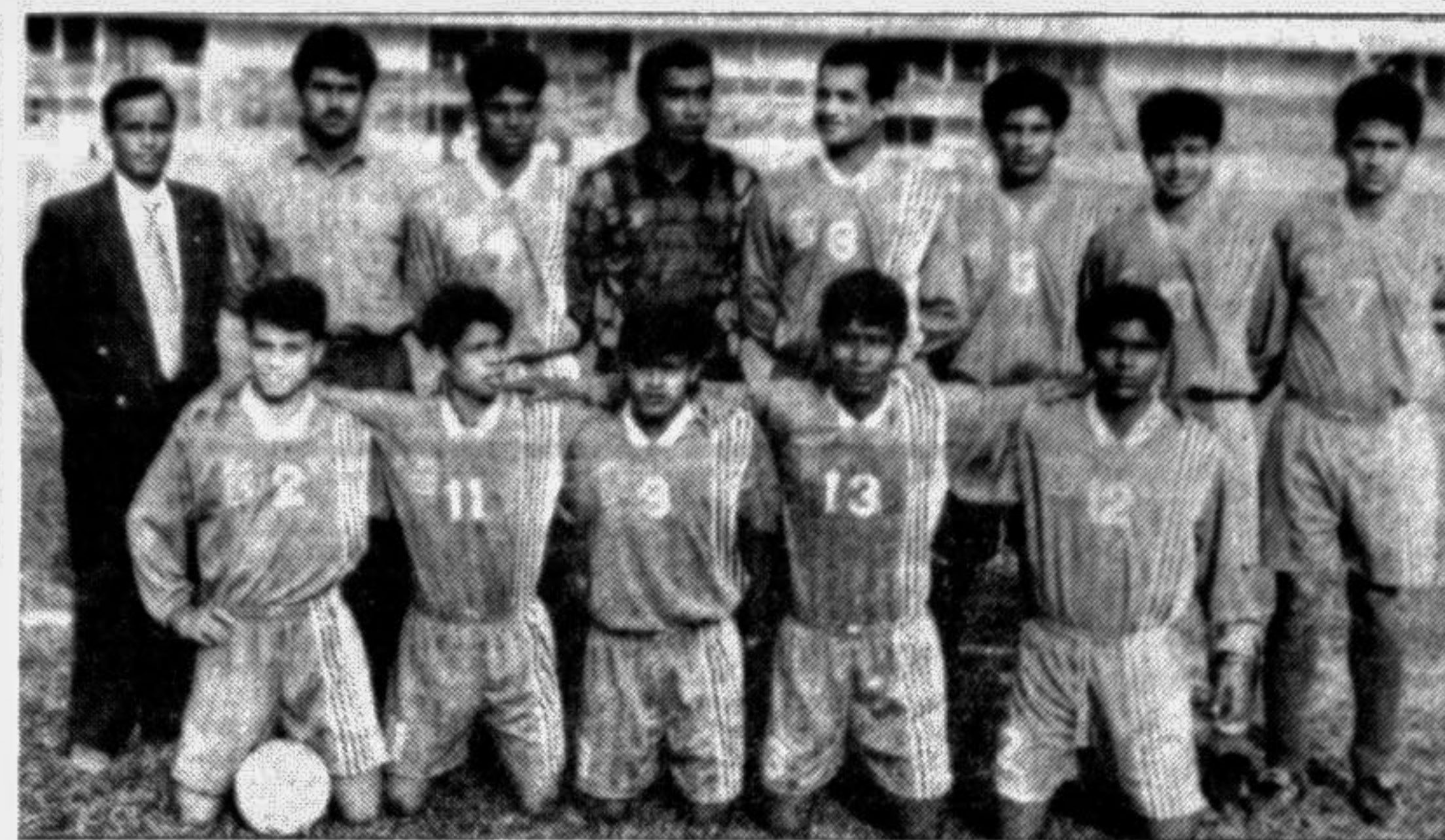
Dhaka University, winners of the football gold in the Sixth Bangladesh Games.

Major international sporting goods manufacturers have taken steps to counter exploitation of children in Pakistan and elsewhere. They have helped set up schools to encourage children to study instead of work, and some have stopped contracting out work, often to families who put their children to work in the home. The Pakistan government, and even the International Labour Organization, have said eliminating child labour is difficult as poor parents want their children to earn money. Pakistan also has complained that it has been singled out in the child labour controversy, saying the problem is common to poor Third World countries in general. The California students sent a letter to their local school board, prompting an invitation to speak before the Board of Education. Their work moved the City Council to approve a motion to investigate the production of soccer balls made in countries using child labour. Not everyone embraced the students' work.