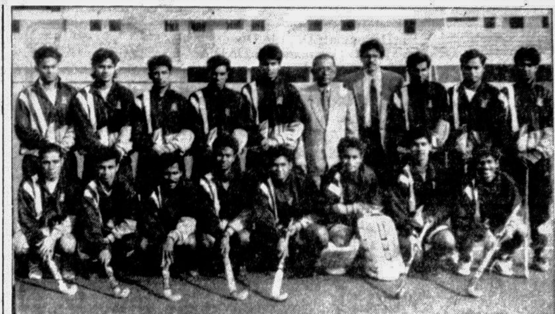
Dhaka University, winners of the Sixth Bangladesh Games hockey gold.