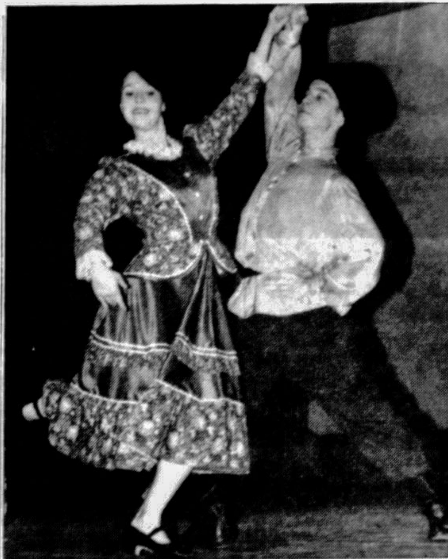
Members of Russian cultural troupe performing at National Museum auditorium in the city yesterday.

Prime Minister Sheikh Hasina will inaugurate the exhibition and distribute the awards among the winners on that day.