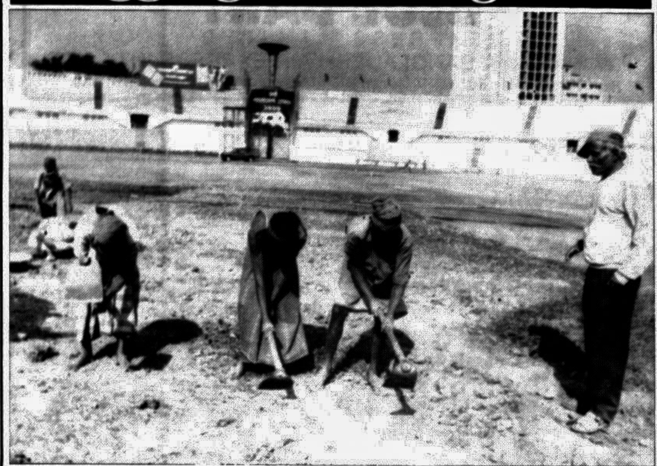
The wicket at the Dhaka Stadium was turned upside down on Sunday in preparation for the Bangladesh Cup football beginning December 30. All the cricket clubs have joined a boycott of cricket league matches at other venues. The wicket will not be again ready before February and the ICC Trophy is in March. Do our cricketers have a chance at the ICC Trophy with the main wicket inoperative till February? Could we not have the Bangladesh Cup at the Mirpur Stadium? These are the burning questions that may scorch our cricket potentials for good.